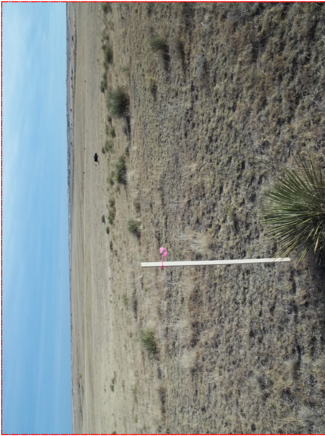
NORTHWEST CORNER OF SITE, LOOKING SOUTHEAST