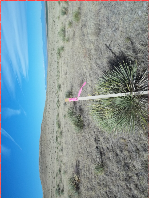
SOUTHEAST CORNER OF SITE, LOOKING NORTHWEST