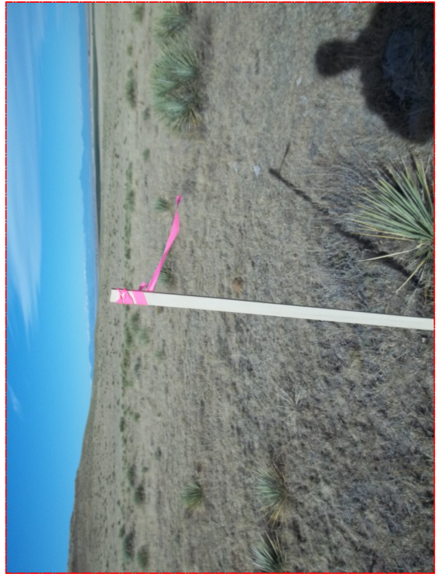
NORTHEAST CORNER OF SITE, LOOKING SOUTHWEST