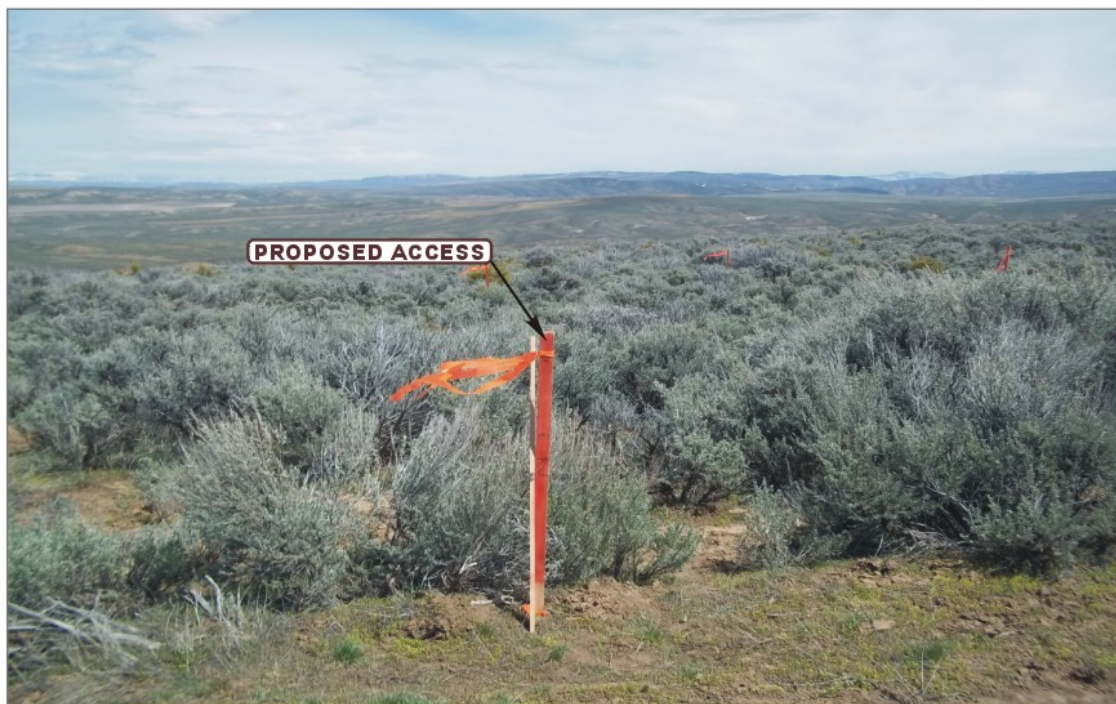
PHOTO: VIEW OF PROPOSED ACCESS