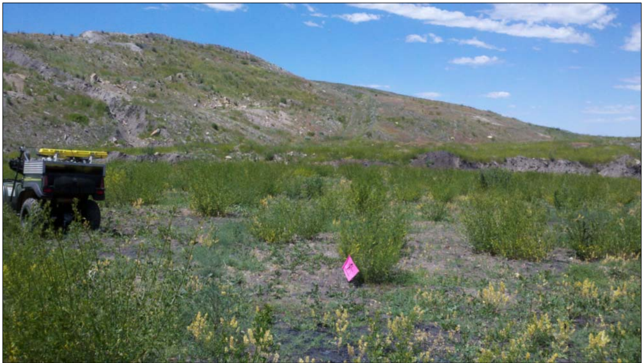
Photo: View from Location Stake to West