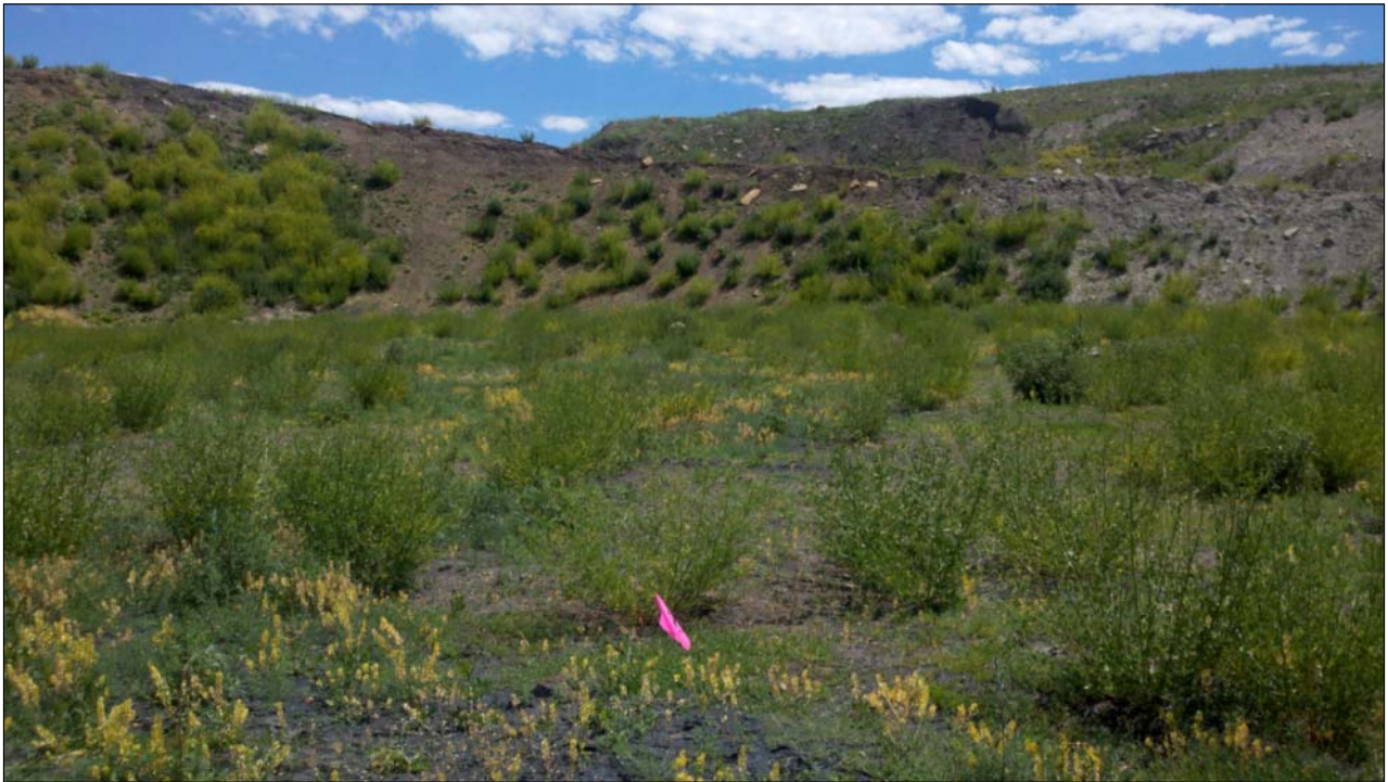
Photo: View from Location Stake to East