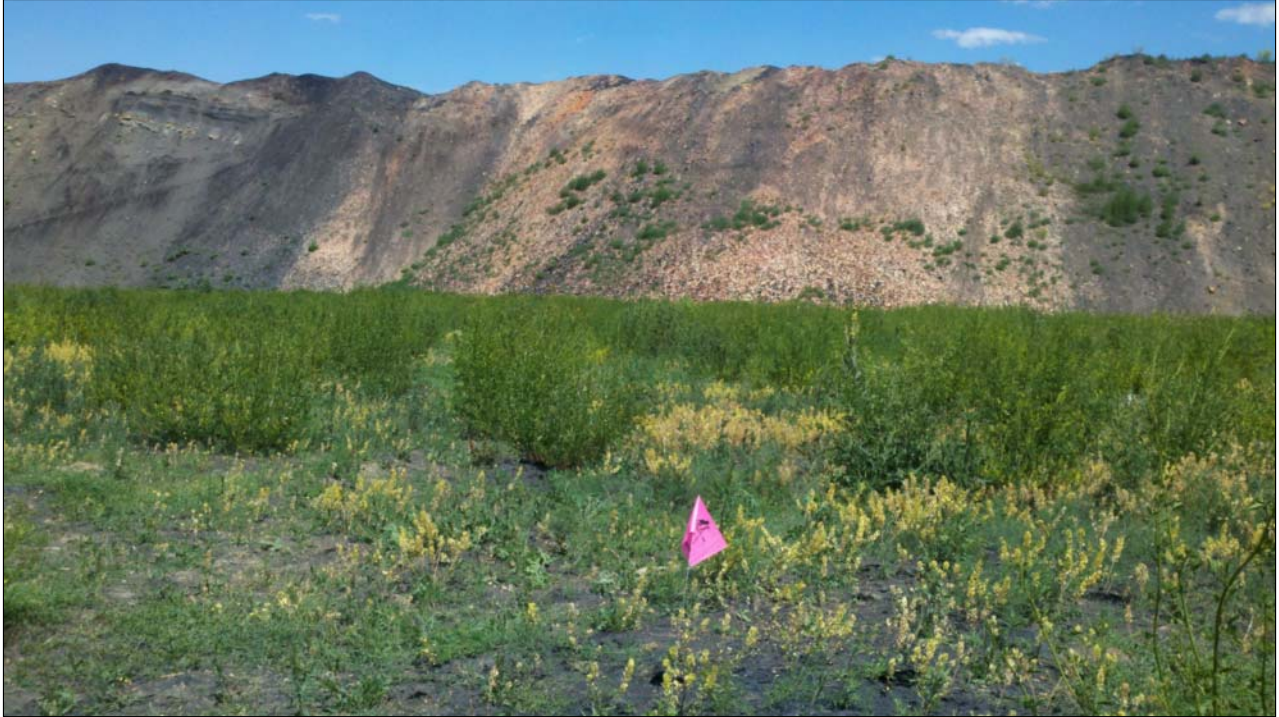
Photo: View from Location Stake to North