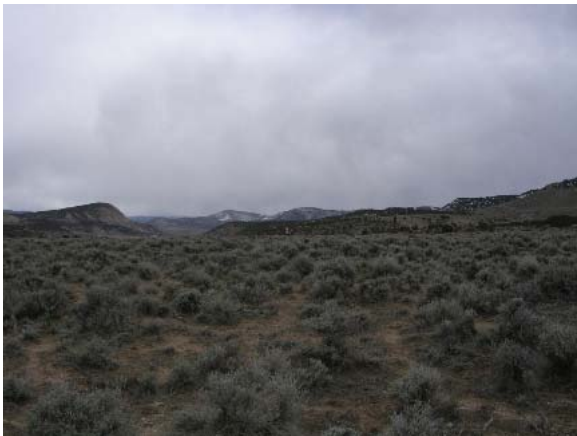
WELL LOCATION LOOKING EAST