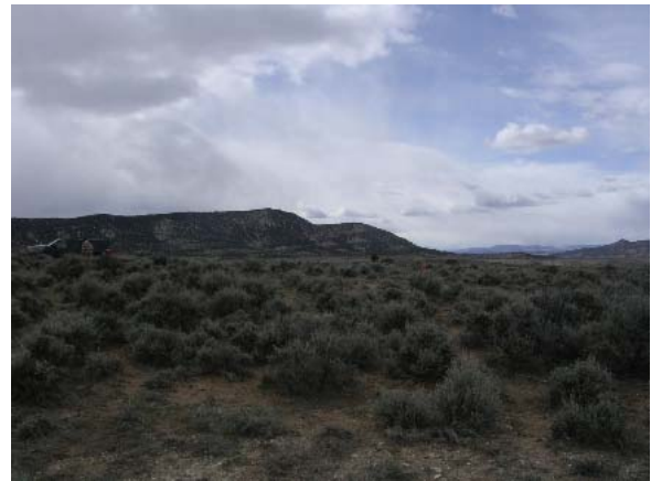
WELL LOCATION LOOKING WEST