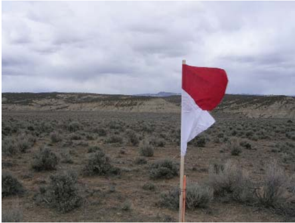
WELL LOCATION LOOKING NORTH