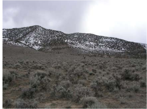
WELL LOCATION LOOKING SOUTH