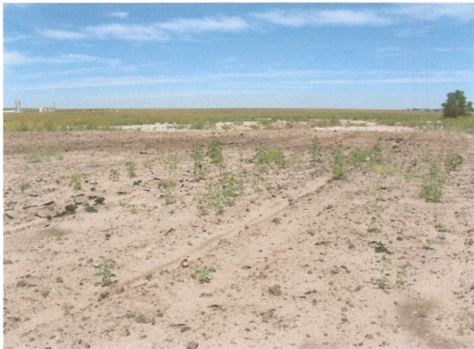
Landfarm area looking north with shredded plastic throughout oily waste.