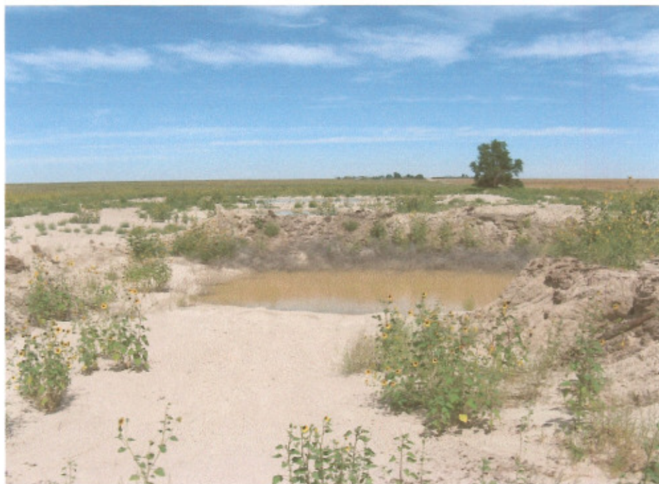
Remaining open water pit and disturbed area to north.