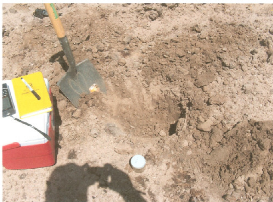
Soil sample SS-3