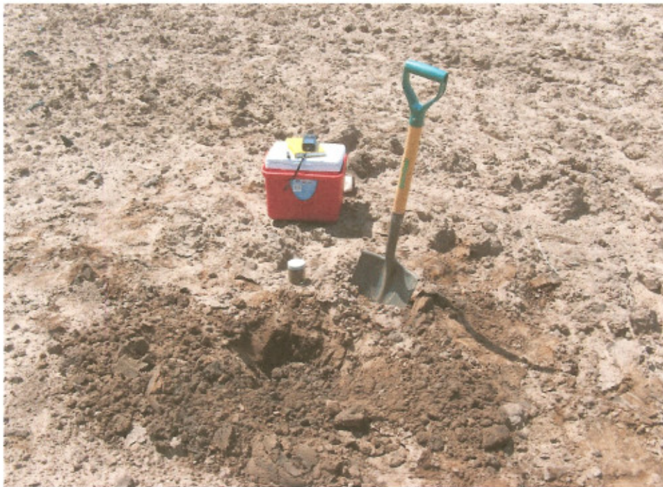
Soil sample SS-1