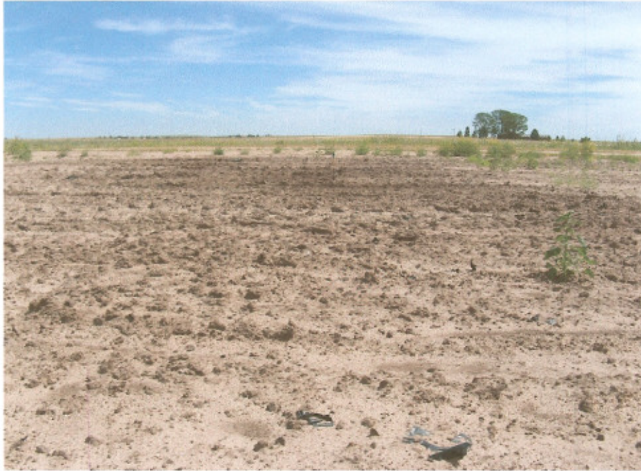
Landfarm area looking east - heavily stained area.

COGCC Inspection #200319859 – Church #2 (121-08776) Remediation Project #4301 NOAV #200191177 Inspection Date: 8/18/11