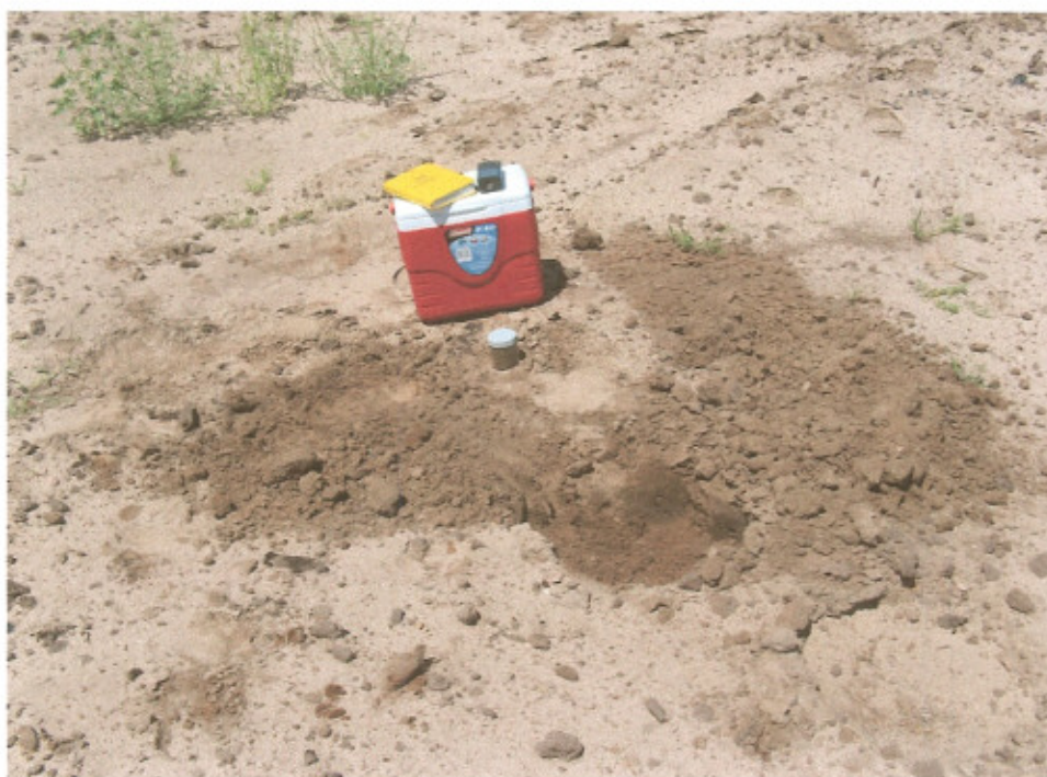
Soil sample SS-2