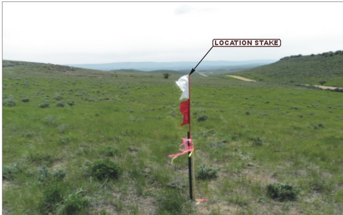
PHOTO: VIEW OF LOCATION STAKE