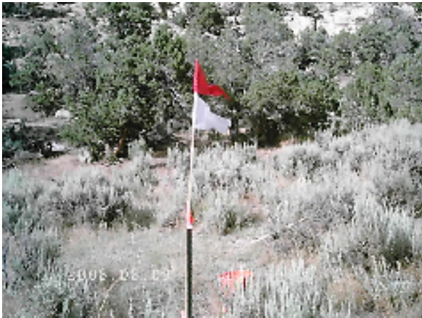
WELL LOCATION LOOKING EAST