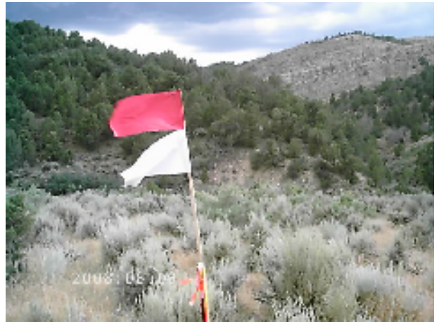
WELL LOCATION LOOKING WEST