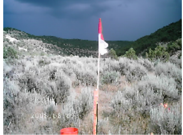
WELL LOCATION LOOKING SOUTH