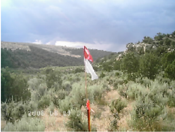
WELL LOCATION LOOKING NORTH