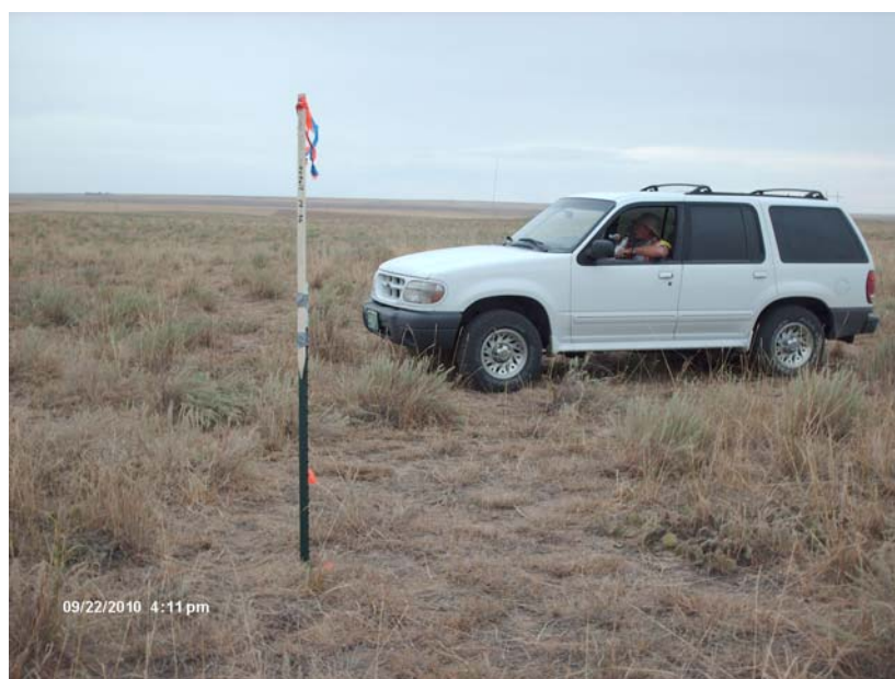
WHITETAIL 14-36 SW 1/4 SW 1/4 SEC. 36 T6N R62W Looking EAST SEPTEMBER22, 2010