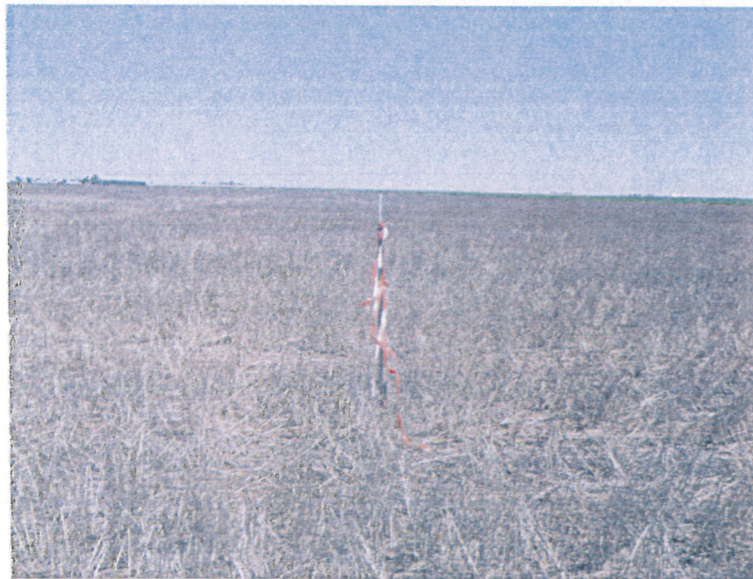
Schlachter 743-6-12 SW ¼ NW ¼ SEC. 6, T7N, R43W Looking North 10 June, 2011