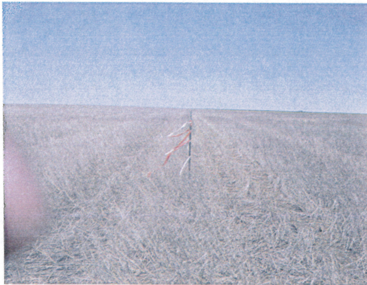
Schlachter 743-6-12 SW ¼ NW ¼ SEC. 6, T7N, R43W Looking West 10 June, 2011