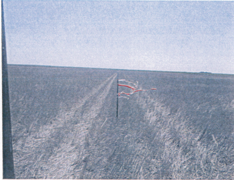
Schlachter 743-6-12 SW ¼ NW ¼ SEC. 6, T7N, R43W Looking East 10 June, 2011