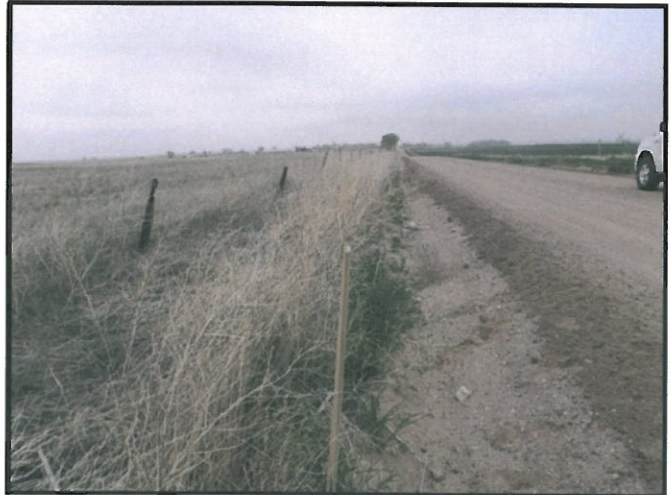
Looking down the roadway to the left of the access