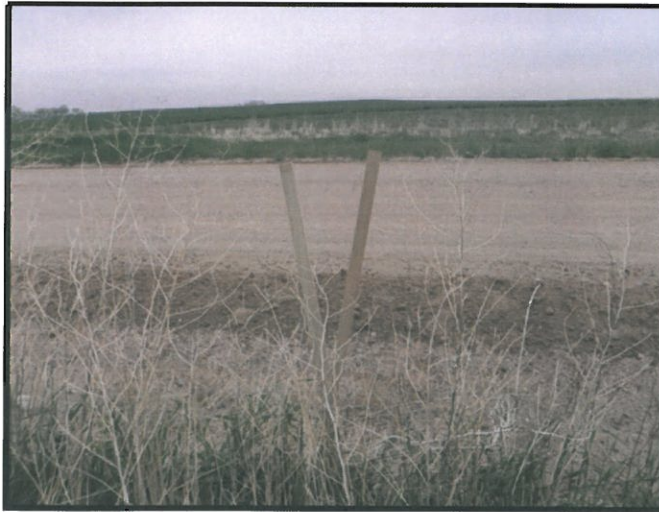
Looking from the access to the roadway