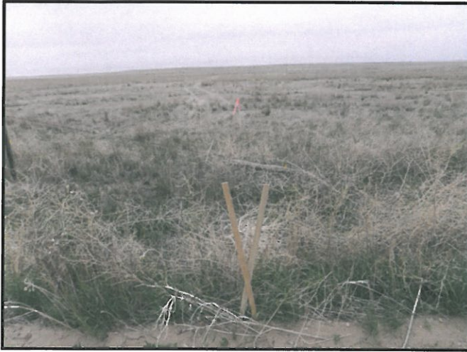
Looking from the roadway into the access location