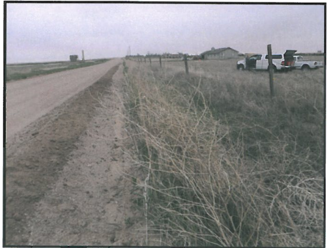
Looking down the roadway to the right of the access