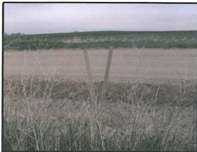
Looking from the access to the roadway