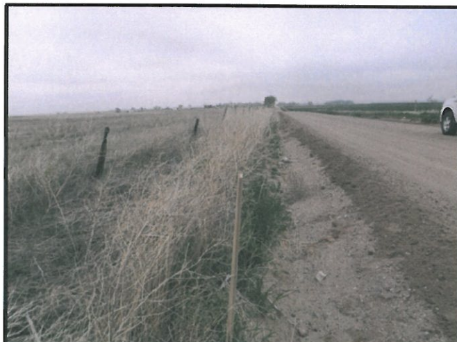
Looking down the roadway to the left of the access