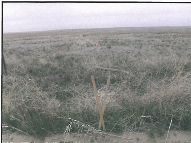
Looking from the roadway into the access location