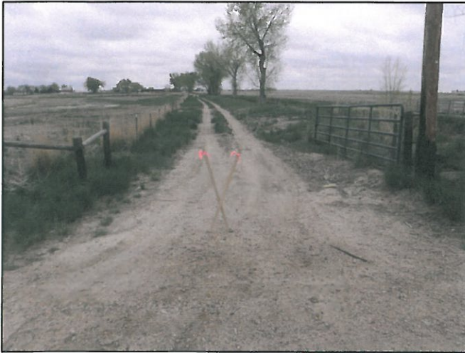
Looking from the roadway into the access location