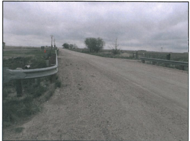
Looking down the roadway to the left of the access