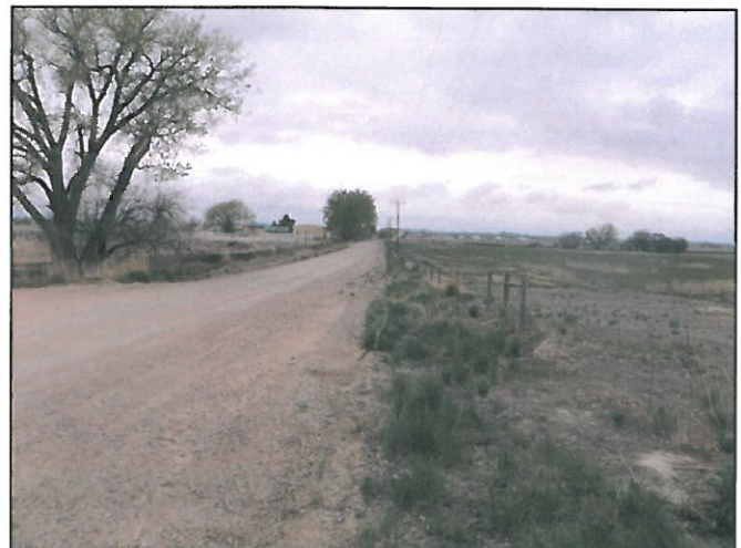
Looking down the roadway to the right of the access