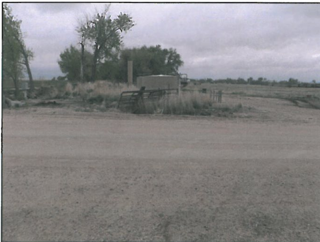
Looking from the access to the roadway