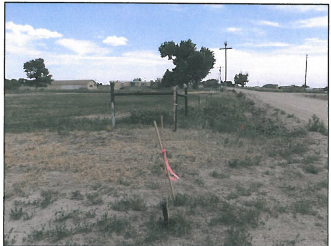
Looking down the roadway to the left of the access