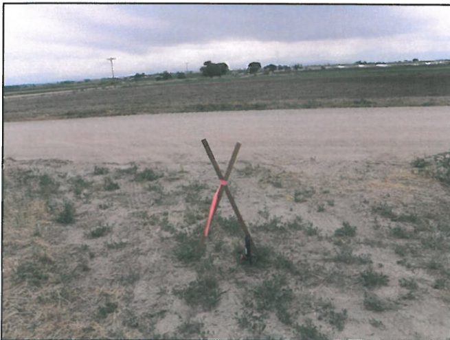
Looking from the access to the roadway