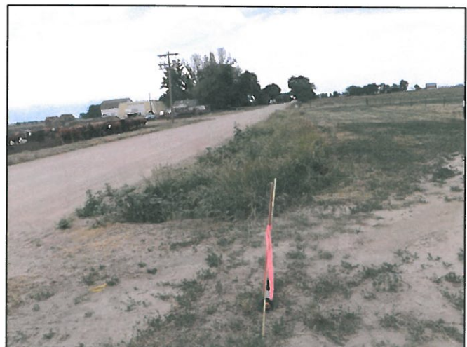
Looking down the roadway to the right of the access