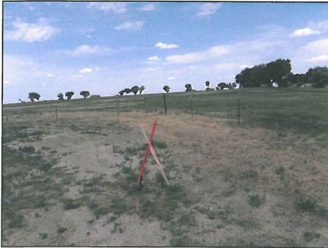
Looking from the roadway into the access location