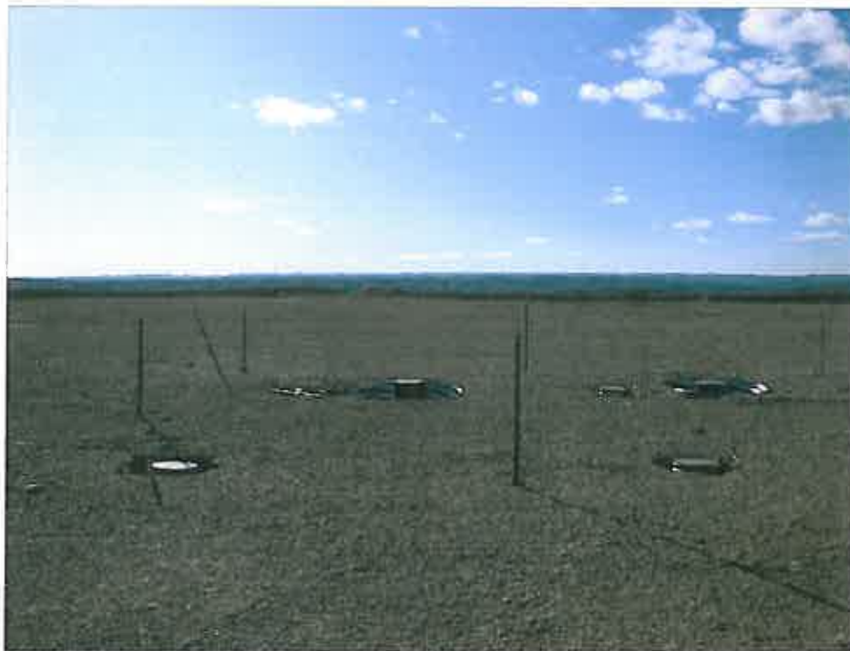
WELL LOCATION LOOKING WEST PHOTOS TAKEN ON 10/01/2009