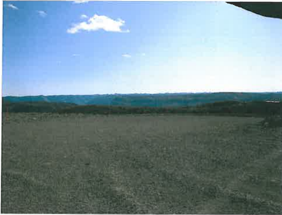
PROPOSED ACCESS AT PAD