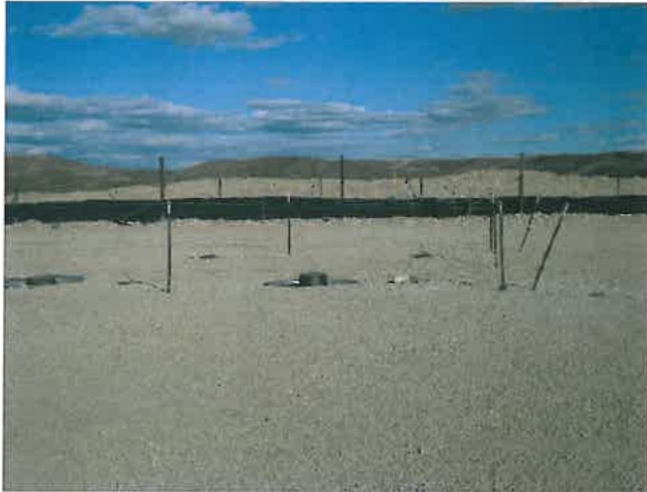
WELL LOCATION LOOKING EAST