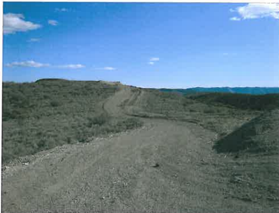
PROPOSED ACCESS AT TAKEOFF PHOTOS TAKEN ON 10/01/2009