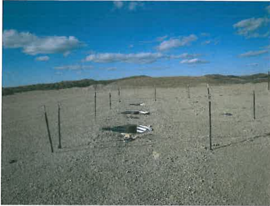
WELL LOCATION LOOKING NORTH