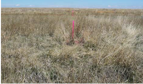
PROPOSED ACCESS AT PAD LOOKING NORTH