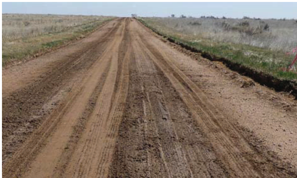
PROPOSED ACCESS TAKE-OFF AT COUNTY ROAD 96 LOOKING EAST