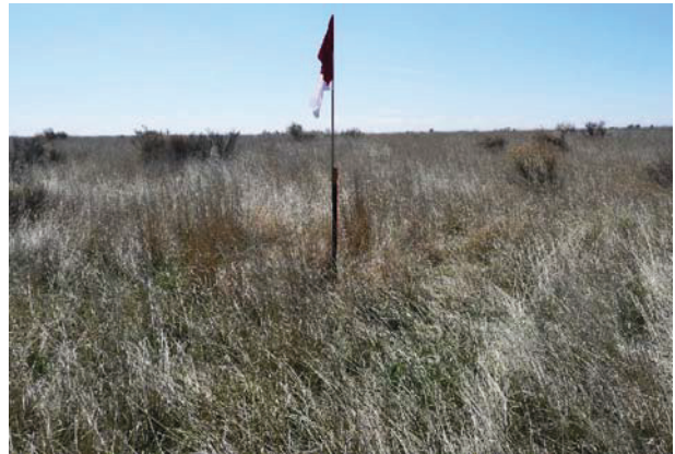
WELL LOCATION LOOKING SOUTH