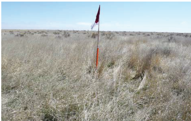
WELL LOCATION LOOKING EAST