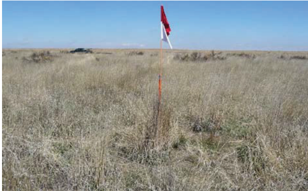
WELL LOCATION LOOKING NORTH