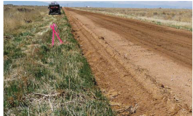
PROPOSED ACCESS TAKE-OFF AT COUNTY ROAD 96 LOOKING WEST