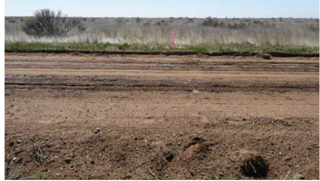
PROPOSED ACCESS TAKE-OFF AT COUNTY ROAD 96 LOOKING SOUTH