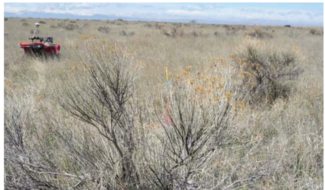
WELL LOCATION LOOKING WEST