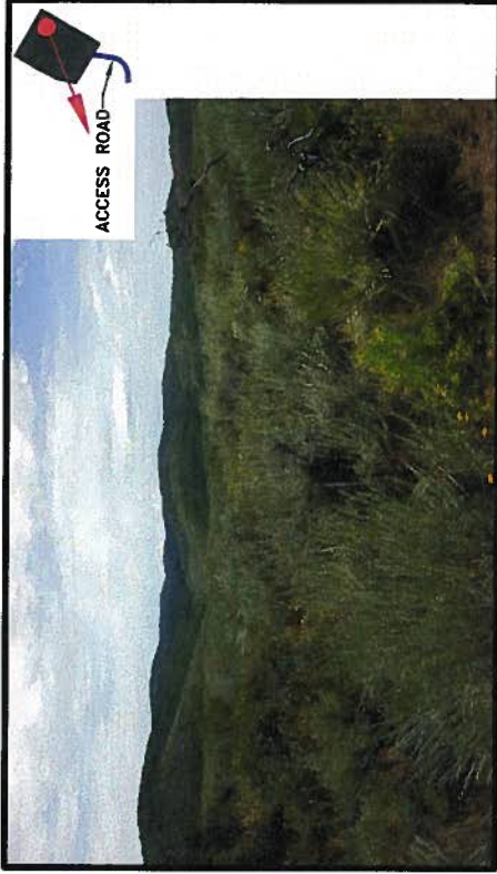
E CORNER OF PAD LOOKING WESTERLY AUGUST 28, 2007