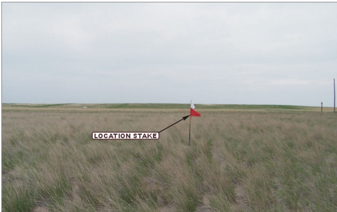
PHOTO: VIEW OF LOCATION STAKE