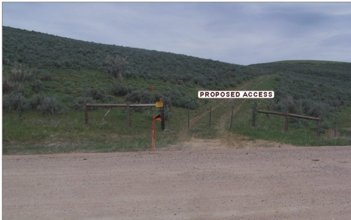
PHOTO: VIEW FROM BEGINNING OF PROPOSED ACCESS