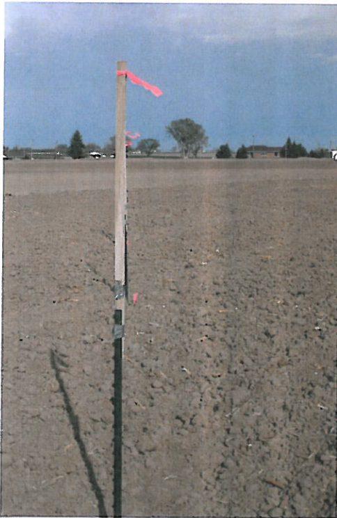
Figure 2: Looking East