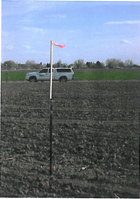
Figure 1: Haythorn 36CD, Looking north toward access off WCR 76