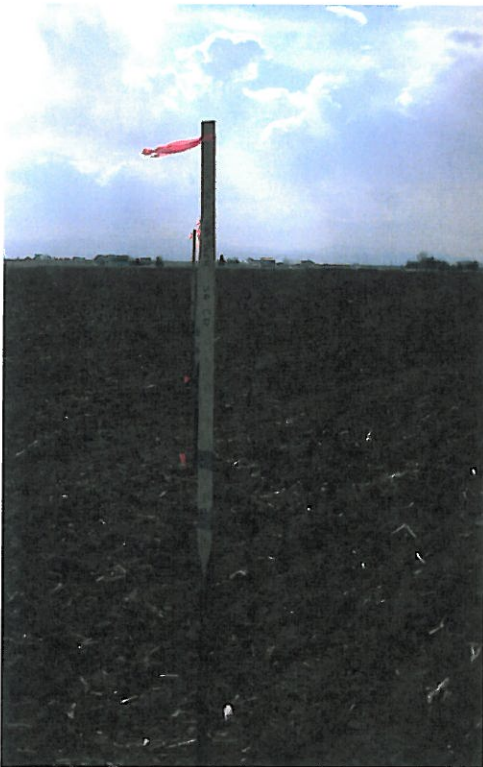
Figure 4: Looking West