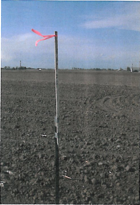
Figure3: Looking South