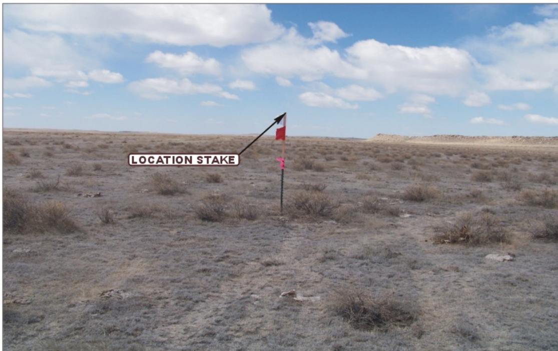
PHOTO: VIEW OF LOCATION STAKE