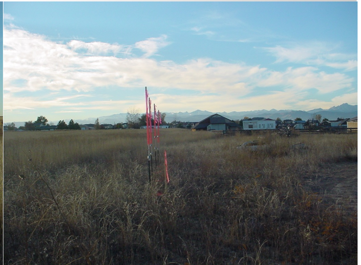
WOOLLEY WELLS • WEST VIEW