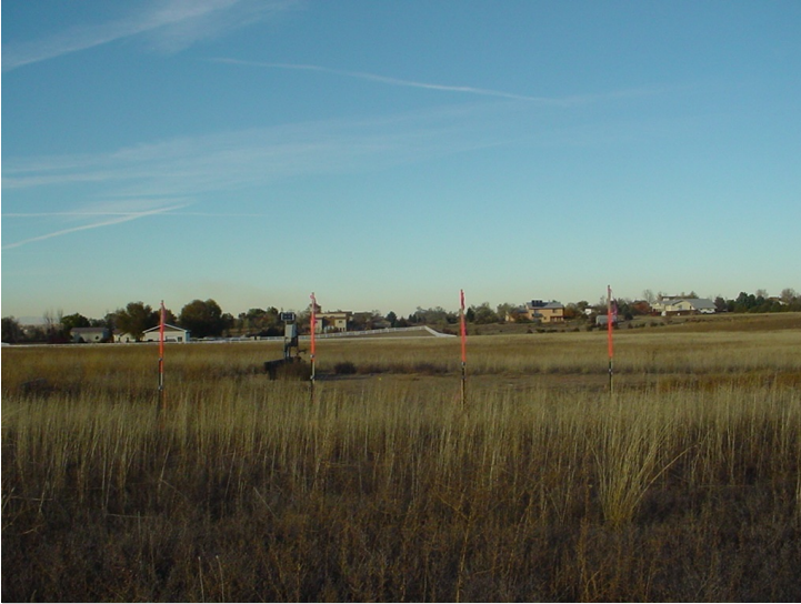
WOOLLEY WELLS • NORTH VIEW