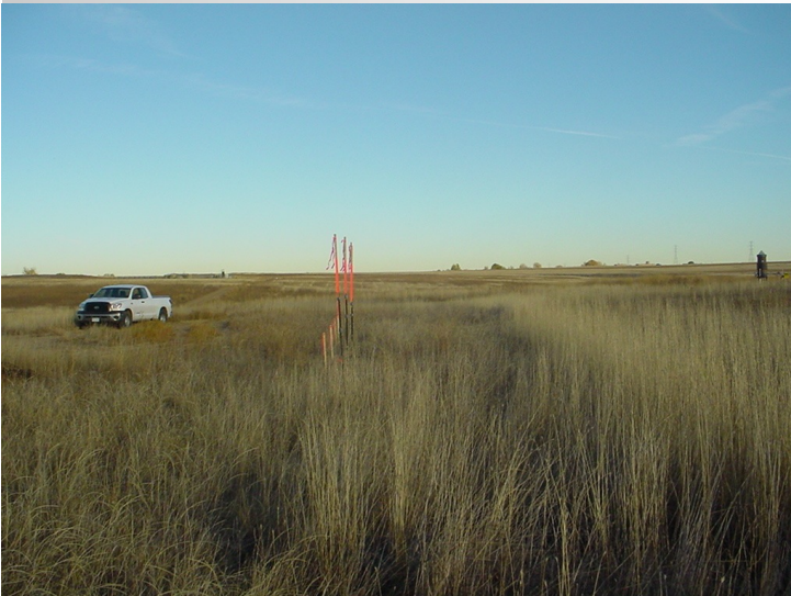
WOOLLEY WELLS • EAST VIEW