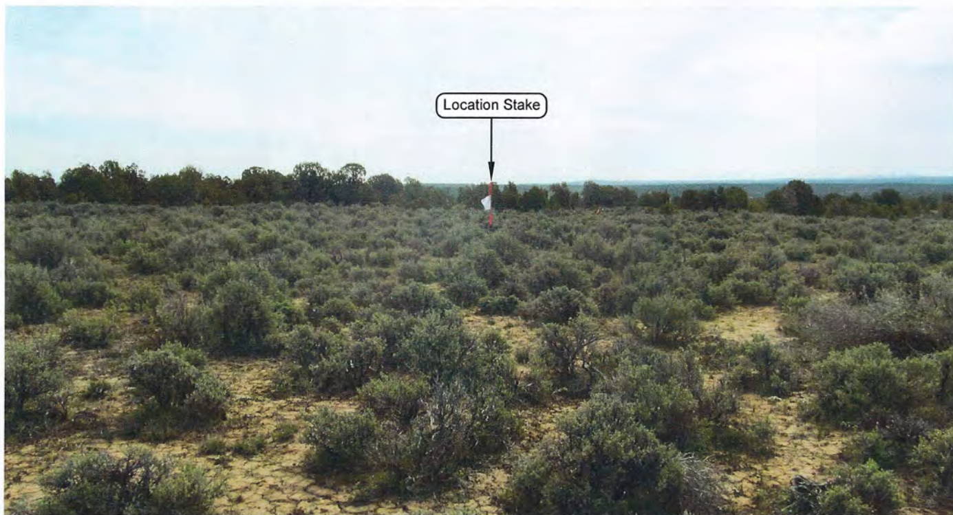
PHOTO LOCATION: LATITUDE LONGITUDE NAD 83: (40° 00' 00.46"N) (108° 22' 17.92"W)