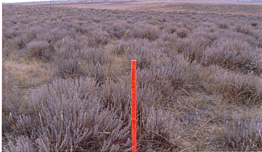
Facility facing south Picture Dated: 11/15/2010