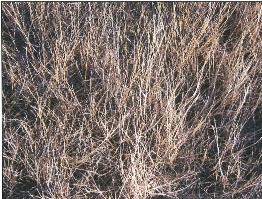
GROUND AT REFERENCE POINT