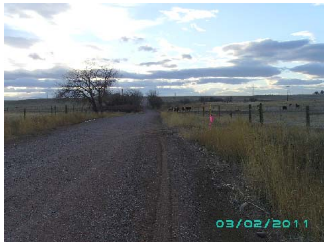
PROPOSED ACCESS TAKE-OFF AT COUNTY ROAD 110 LOOKING WEST