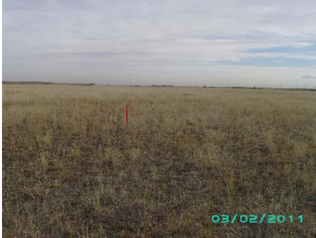
PROPOSED ACCESS AT PAD LOOKING SOUTH