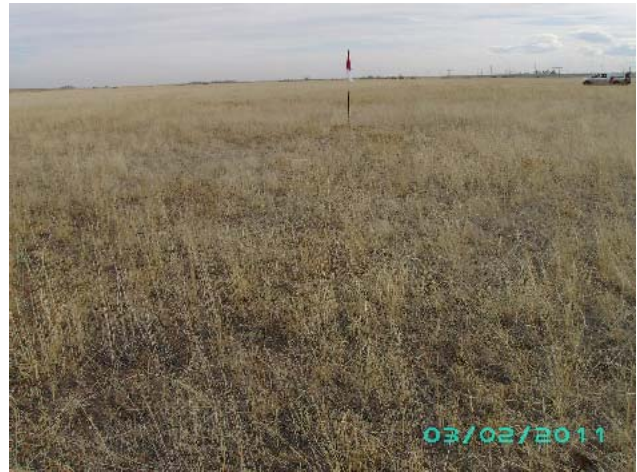
WELL LOCATION LOOKING SOUTH