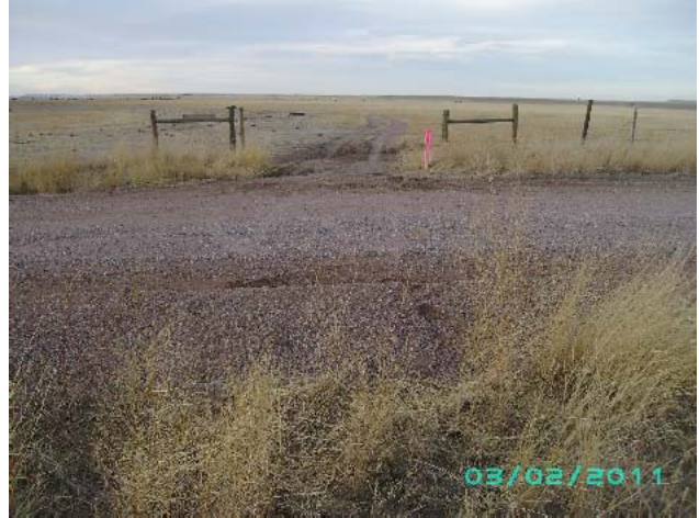
PROPOSED ACCESS TAKE-OFF AT COUNTY ROAD 110 LOOKING NORTH