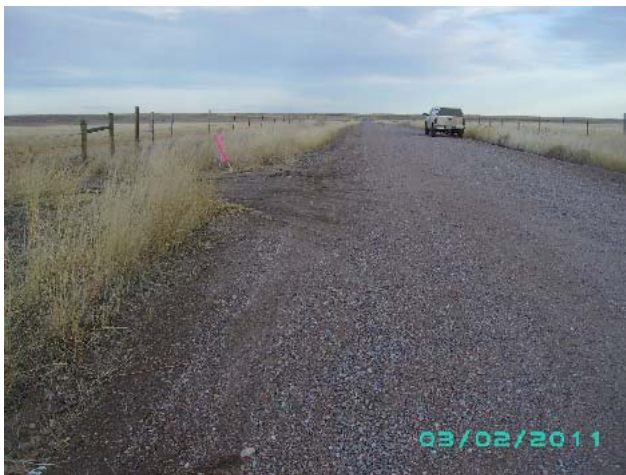
PROPOSED ACCESS TAKE-OFF AT COUNTY ROAD 110 LOOKING EAST