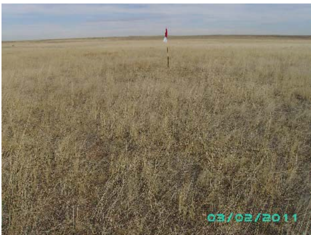
WELL LOCATION LOOKING EAST