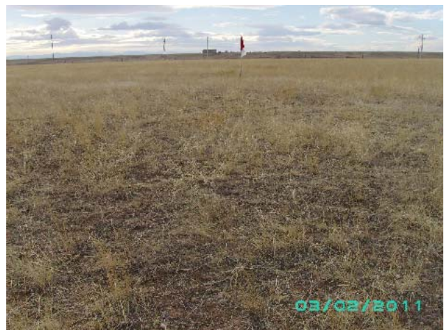
WELL LOCATION LOOKING WEST