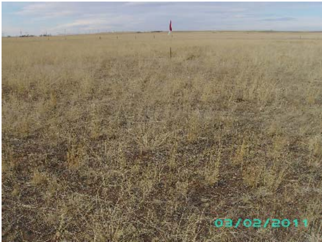
WELL LOCATION LOOKING NORTH