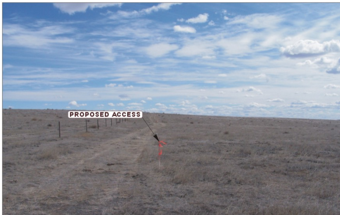
PHOTO: VIEW FROM BEGINNING OF PROPOSED ACCESS