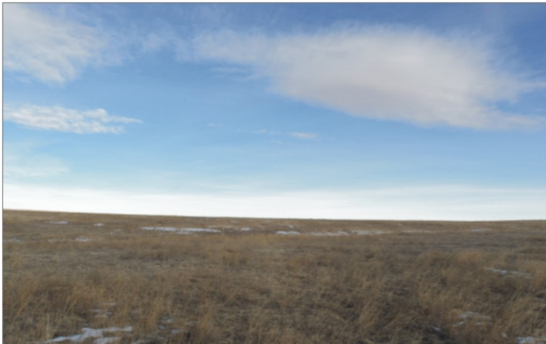
PHOTO: VIEW OF REFERENCE AREA