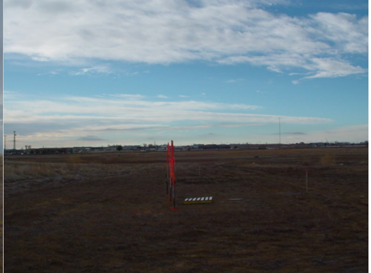
PURITAN WELLS • SOUTH VIEW