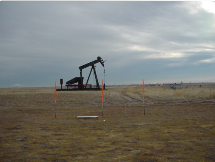
PURITAN WELLS • EAST VIEW