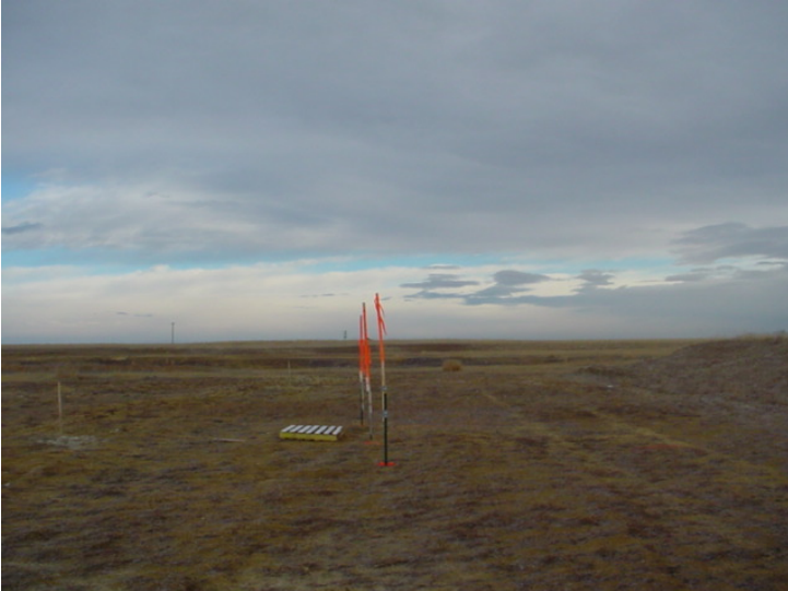
PURITAN WELLS • NORTH VIEW

SHL: NW1/4 OF SE-1/4 SECTION 34-T2N-R68W-6 TH PM WELD COUNTY, COLORADO