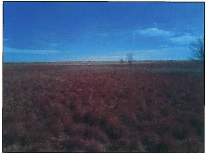
CROW VALLEY 7-62-32-1A East.jpg