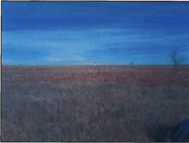
CROW VALLEY 7-62-32-1A North.jpg