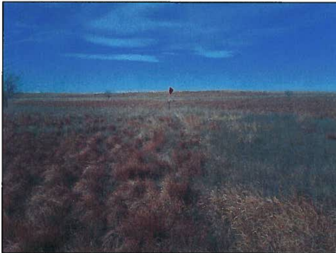
CROW VALLEY 7-62-32-1A West.jpg