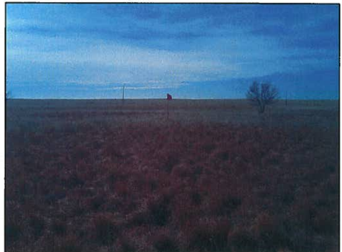
CROW VALLEY 7-62-32-1A South.jpg