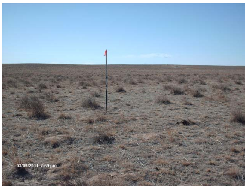
STATE ANTELOPE 11-13 HZ NW 1/4 NW 1/4 SEC. 13 T5N R62W LOOKING WEST MARCH 9, 2011