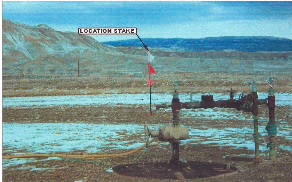
PHOTO: VIEW OF LOCATION STAKE