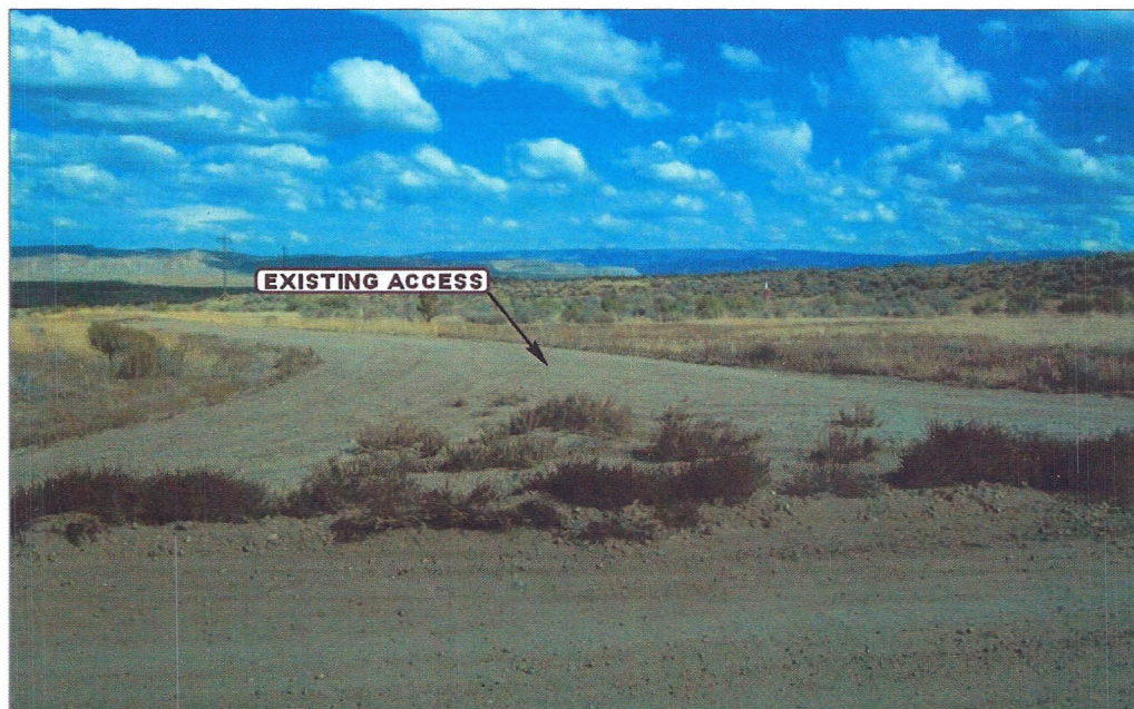
PHOTO: VIEW OF EXISTING ACCESS