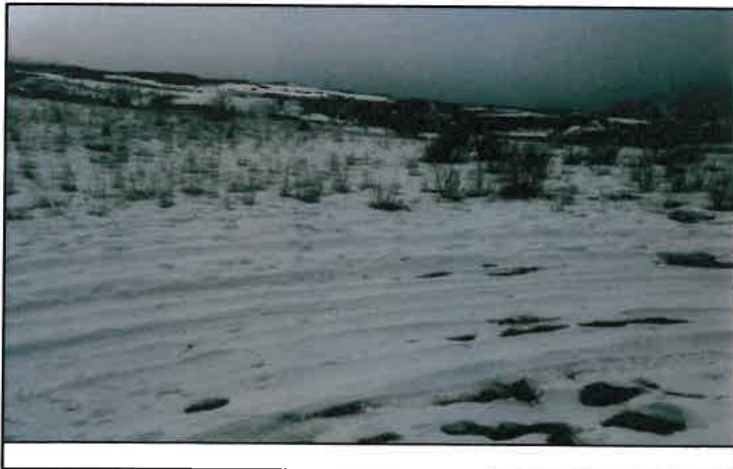
PHOTO: VIEW FROM PAD CENTER