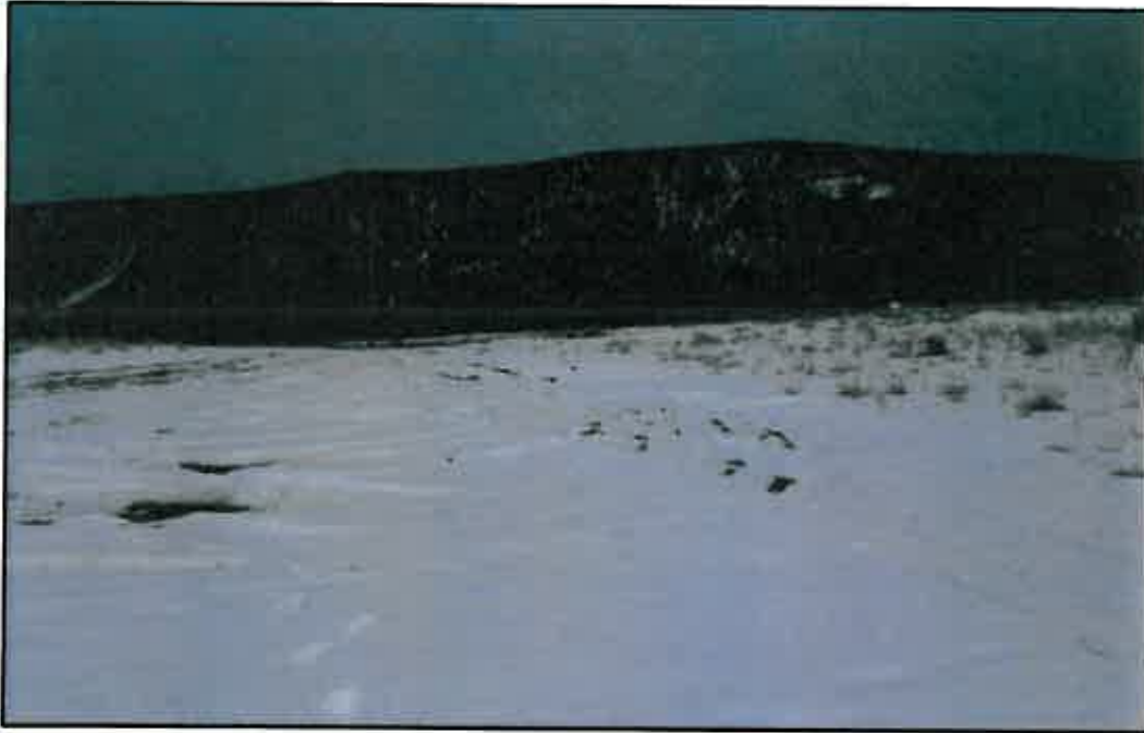
PHOTO: VIEW FROM PAD CENTER

RWF 12-35, RWF 312-35, RWF 422-35, RWF 22-35, RWF 522-35, RWF 23-35, RWF 323-35, RWF 412-35, RWF 313-35, RWF 441-34, RWF 42-34, RWF 342-34, RWF 442-34, RWF 542-34, RWF 343-34, RWF 413-35