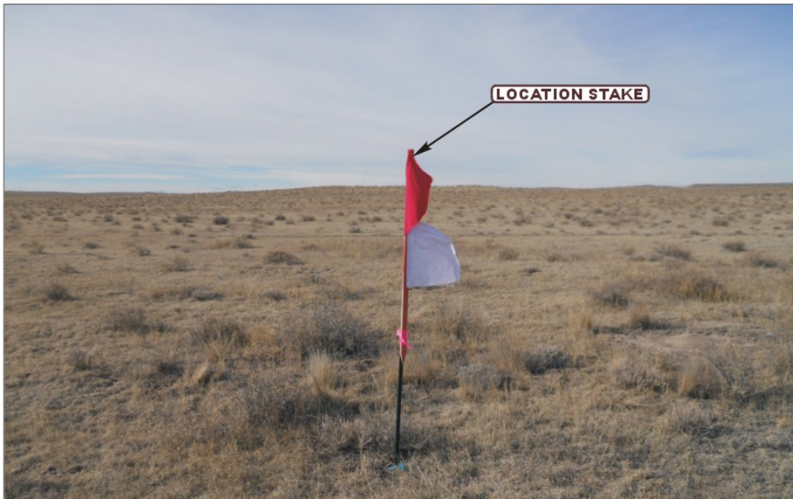
PHOTO: VIEW OF LOCATION STAKE