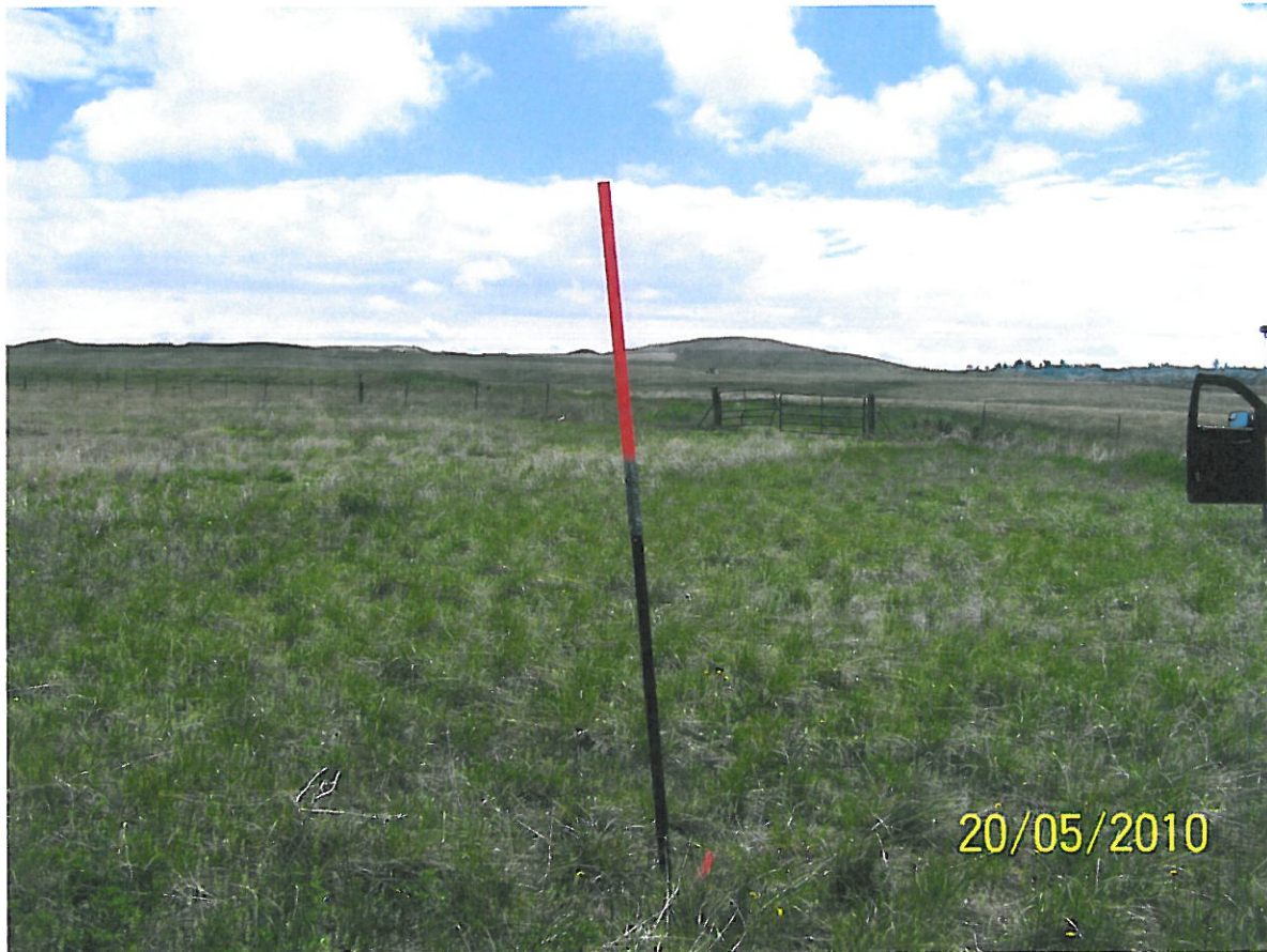
Figure 2: PRATT 24-29D LOOKING EAST (SW1/4 SW1/4 SEC29, T1N, R68W, 5-20-10)