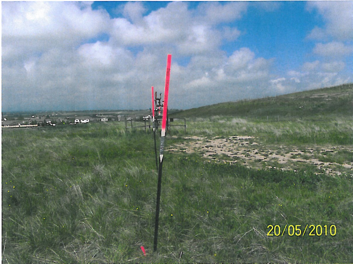
Figure 4: PRATT 24-29D LOOKING WEST (SW1/4 SW1/4 SEC29, T1N, R68W, 5-20-10)