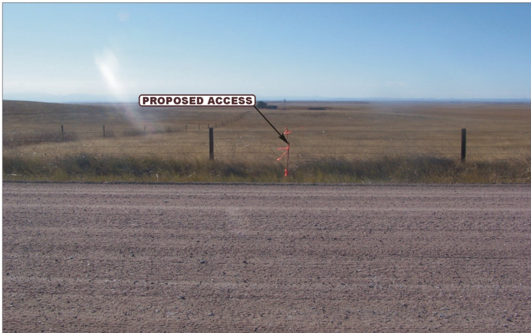
PHOTO: VIEW FROM BEGINNING OF PROPOSED ACCESS