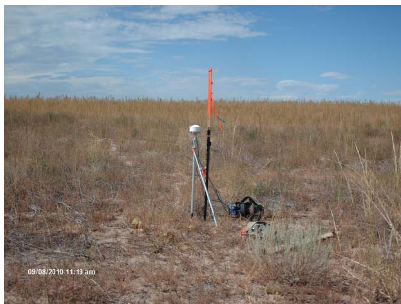
ANTELOPE 41-31 PAD SITE NE 1/4 NE 1/4 SEC. 31 T5N R62W Looking WEST SEPTEMBER 8, 2010