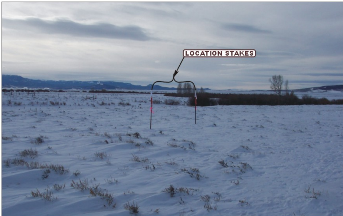
PHOTO: VIEW OF LOCATION STAKES