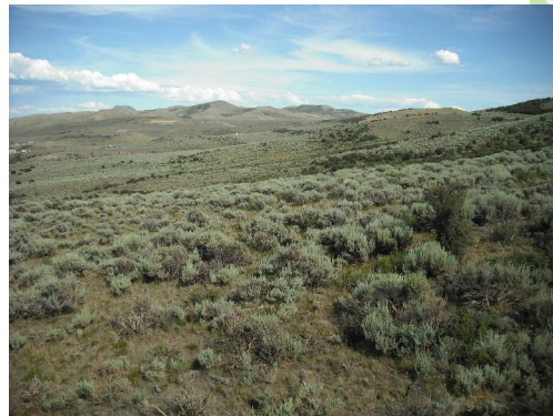
LOCATION LOOKING EAST (#2)