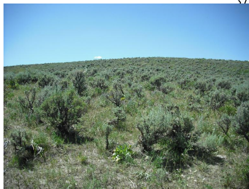
LOCATION LOOKING WEST (#4)