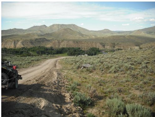
LOCATION LOOKING NORTH (#1)