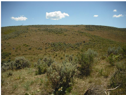
LOCATION LOOKING SOUTH (#3)