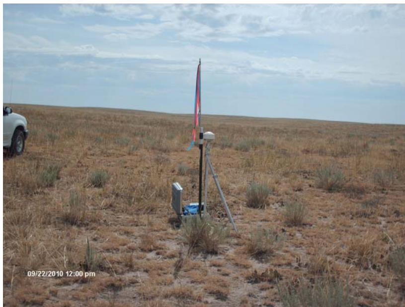
ANTELOPE 11-1 NW ¼ NW ¼ SECTION 1 T5N R62W Looking SOUTH SEPTEMBER 22, 2010