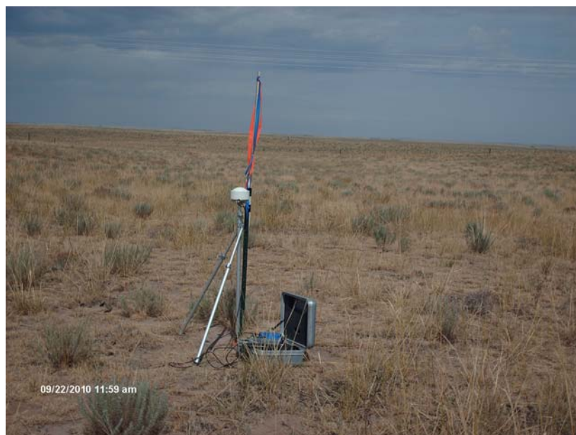
ANTELOPE 11-1 NW 1/4 NW 1/4 SEC. 1 T5N R62W Looking NORTH SEPTEMBER 22, 2010