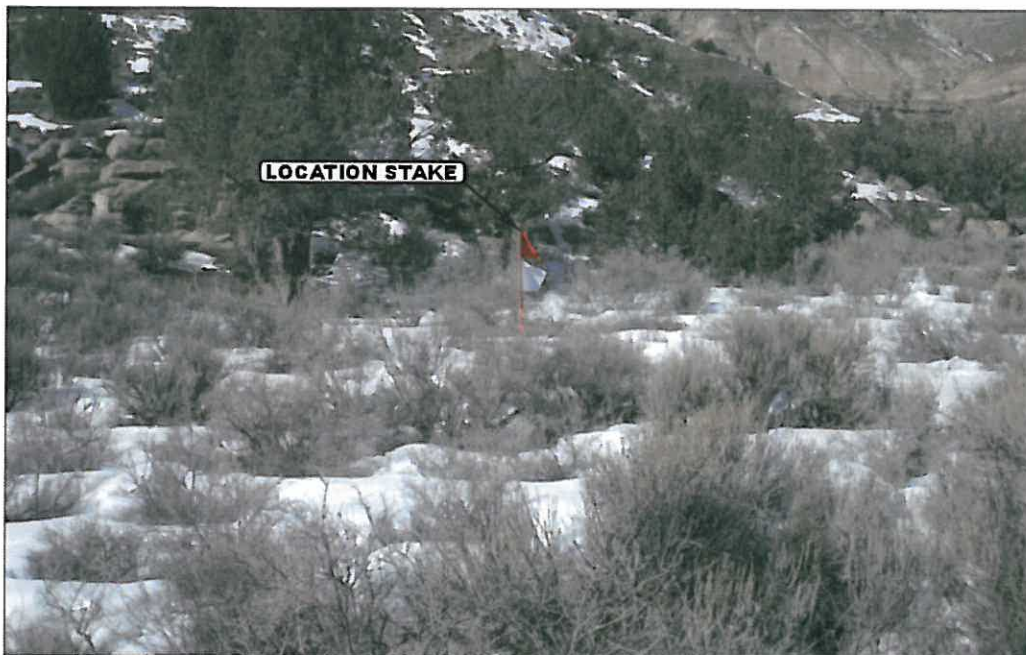
PHOTO: VIEW FROM SE CORNER TO NW CORNER