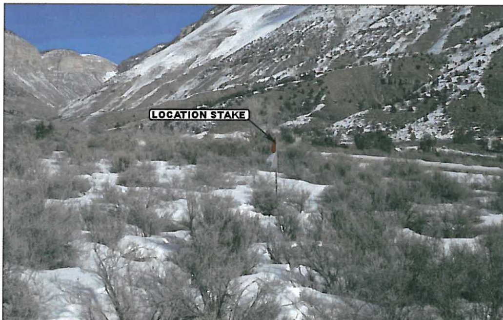
PHOTO: VIEW FROM SW CORNER TO NE CORNER