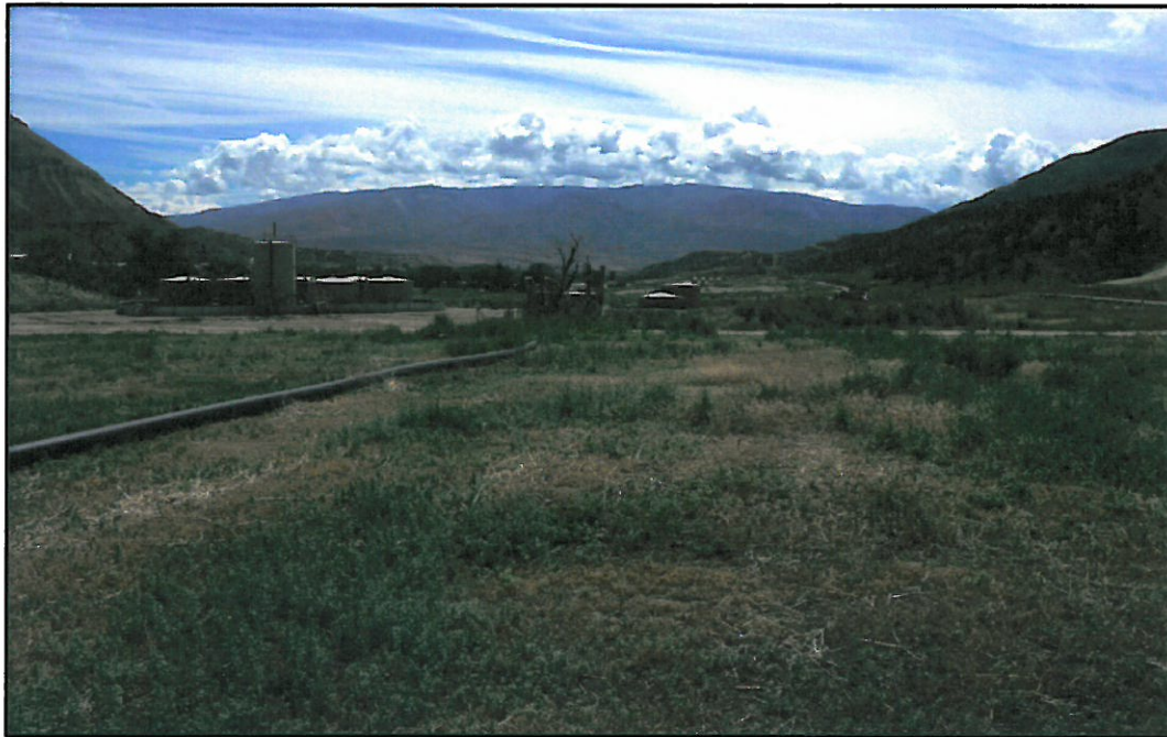
PHOTO: VIEW FROM PAD CENTER