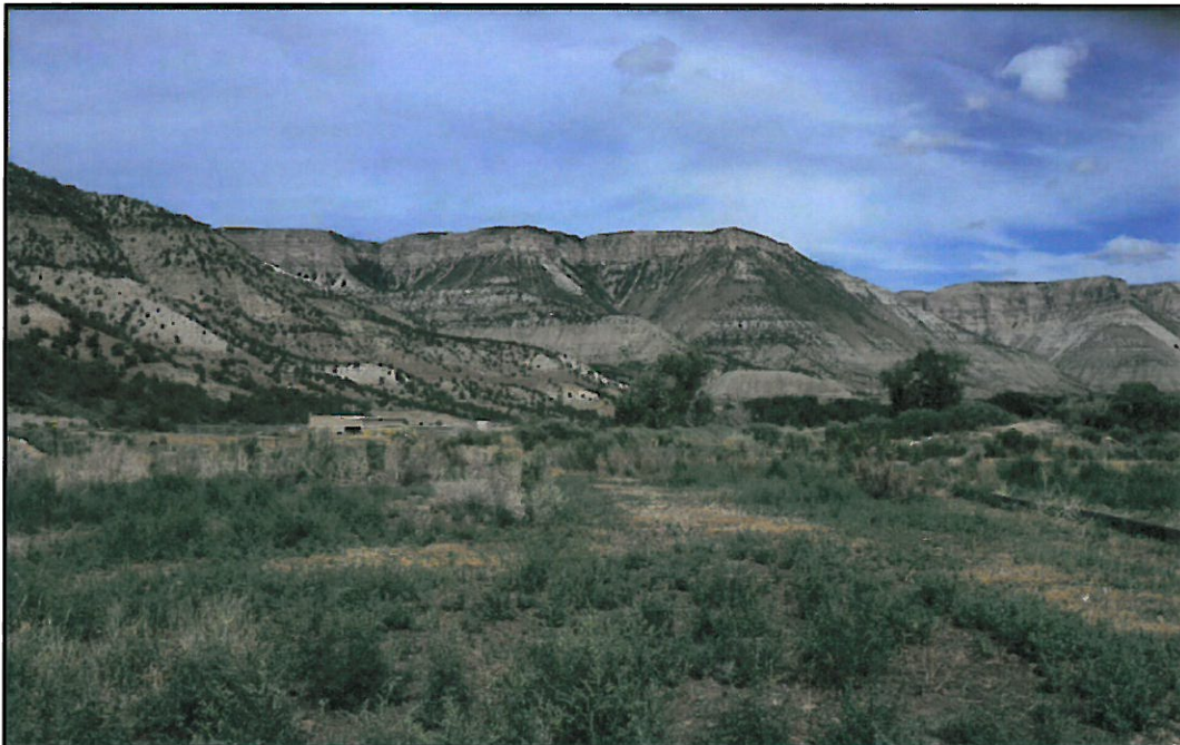
PHOTO: VIEW FROM PAD CENTER