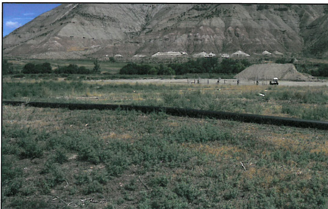
PHOTO: VIEW OVERALL