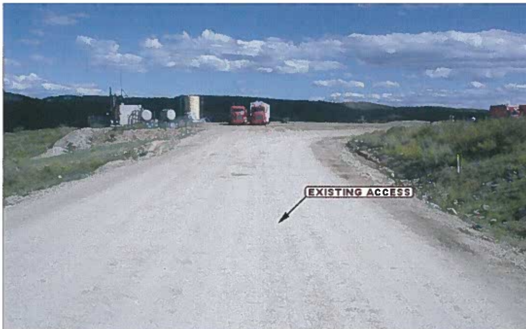
PHOTO: VIEW OF EXISTING ACCESS