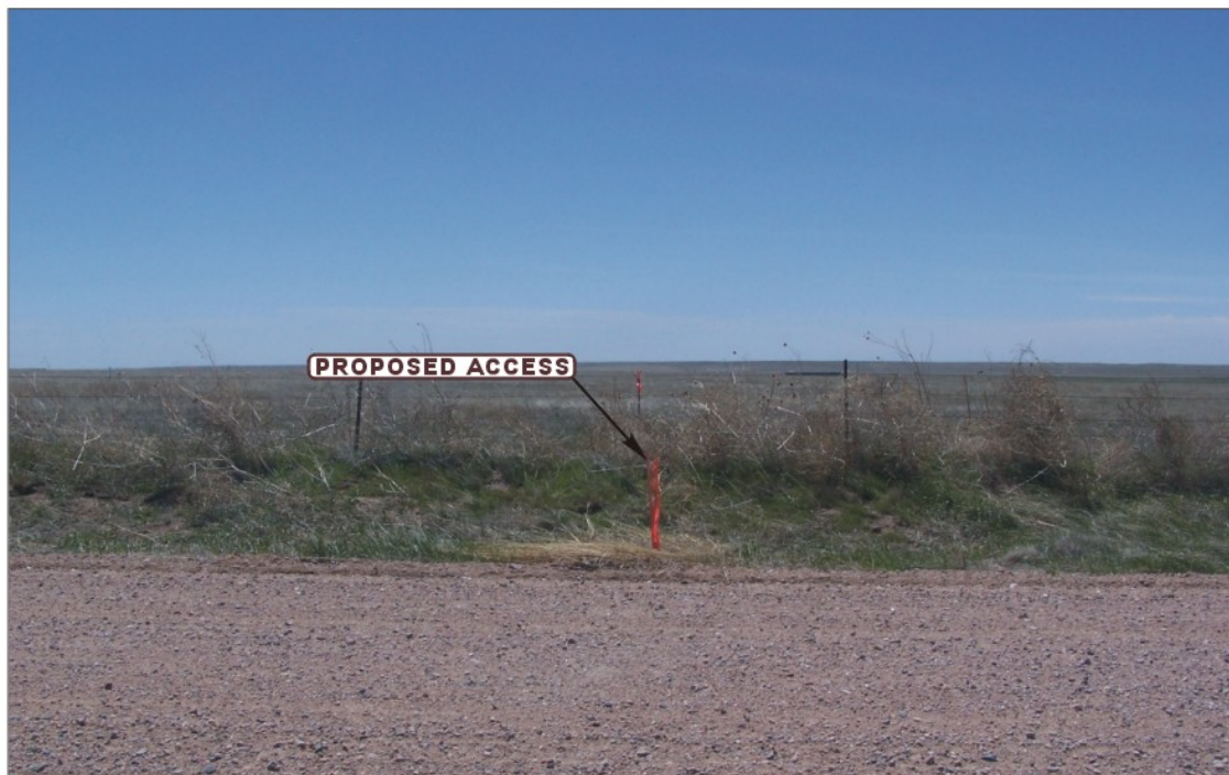
PHOTO: VIEW FROM BEGINNING OF PROPOSED ACCESS