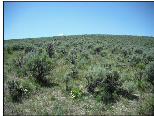
LOCATION LOOKING WEST