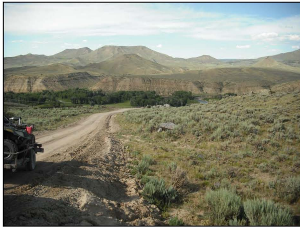
LOCATION LOOKING NORTH