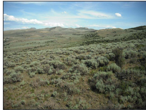
LOCATION LOOKING EAST