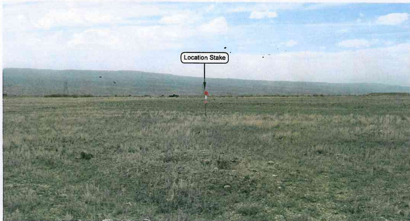
PHOTO LOCATION: LATITUDE LONGITUDE NAD 83: (38° 56' 56.33"N) (108° 20' 44.02"W)