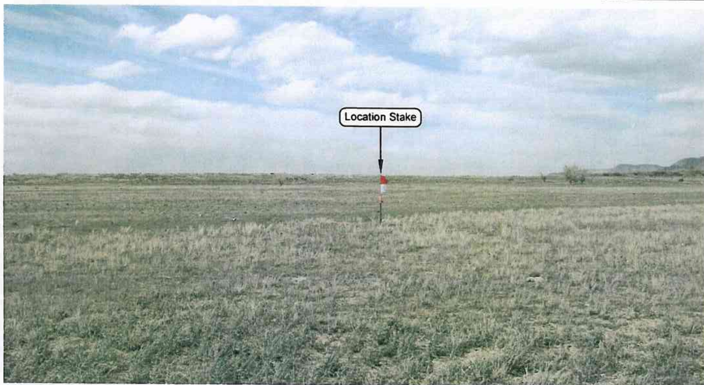
PHOTO LOCATION: LATITUDE LONGITUDE NAD 83: (38° 56' 55.31"N) (108° 20' 45.57"W)