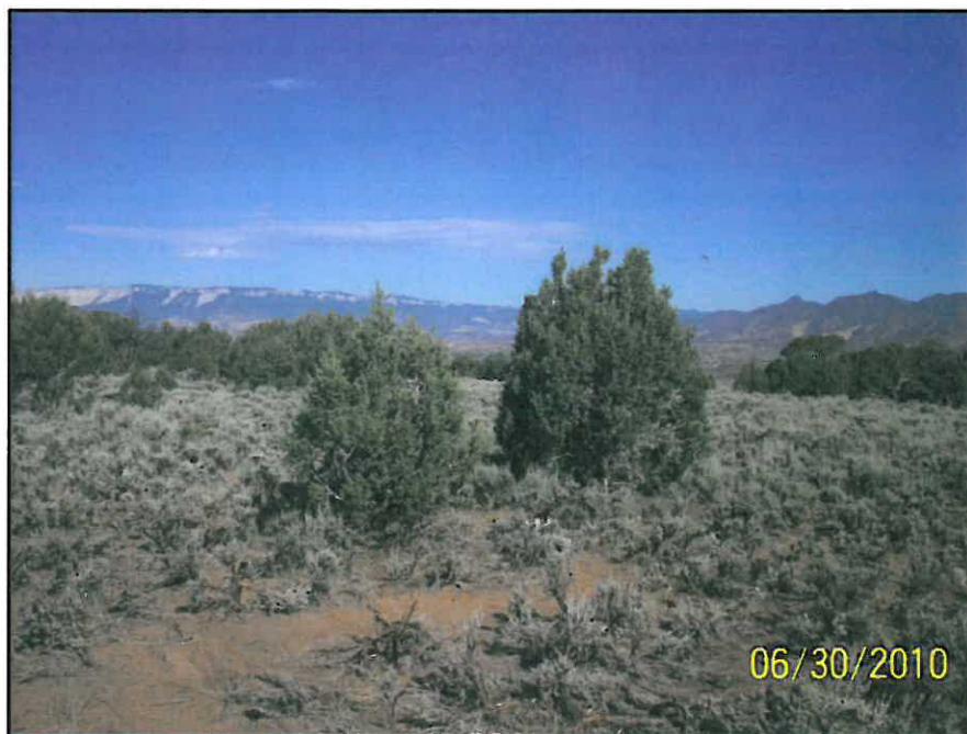
PHOTO: VIEW FROM ACCESS

Jolley KP 413-17, Jolley KP 512-17, Jolley KP 443-18, Jolley KP 442-18