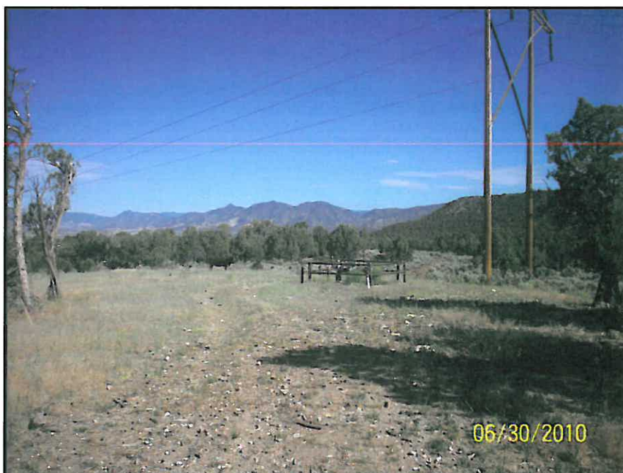
PHOTO: VIEW FROM ACCESS