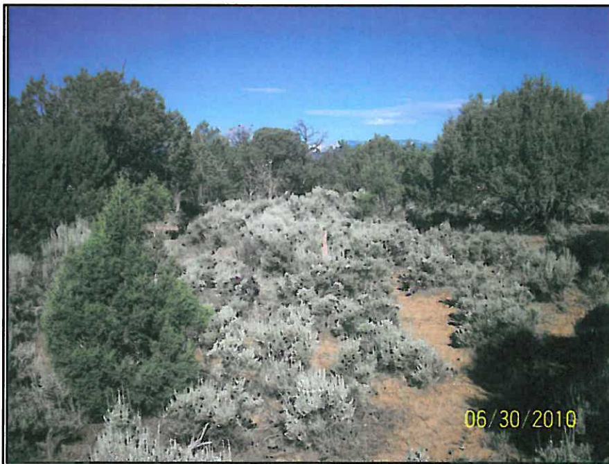
PHOTO: VIEW FROM PAD CENTER