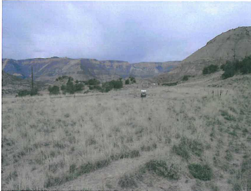
WELL PAD LOOKING WEST

EXXON/MOBIL WELL PAD GM 331-34 EXISTING WELLS: GM 331-34, GM 431-34 PROPOSED WELLS: GM 531-34, GM 541-34, GM 441-34, GM 341-34, GM 41-34 PHOTOS TAKEN 4/21/2010