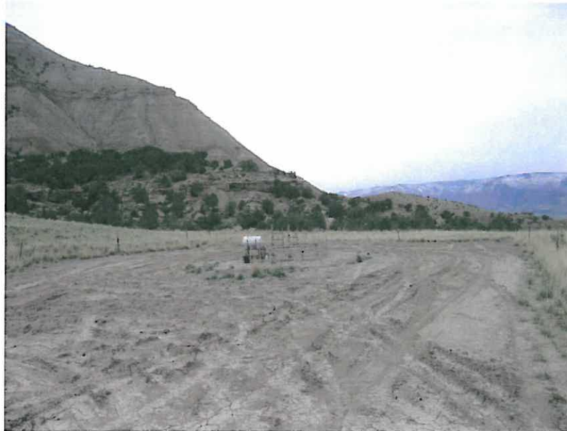
WELL PAD LOOKING EAST

EXXON/MOBIL WELL PAD GM 331-34 EXISTING WELLS: GM 331-34, GM 431-34 PROPOSED WELLS: GM 531-34, GM 541-34, GM 441.-34, GM 341-34, GM 41-34 PHOTOS TAKEN 4/21/2010