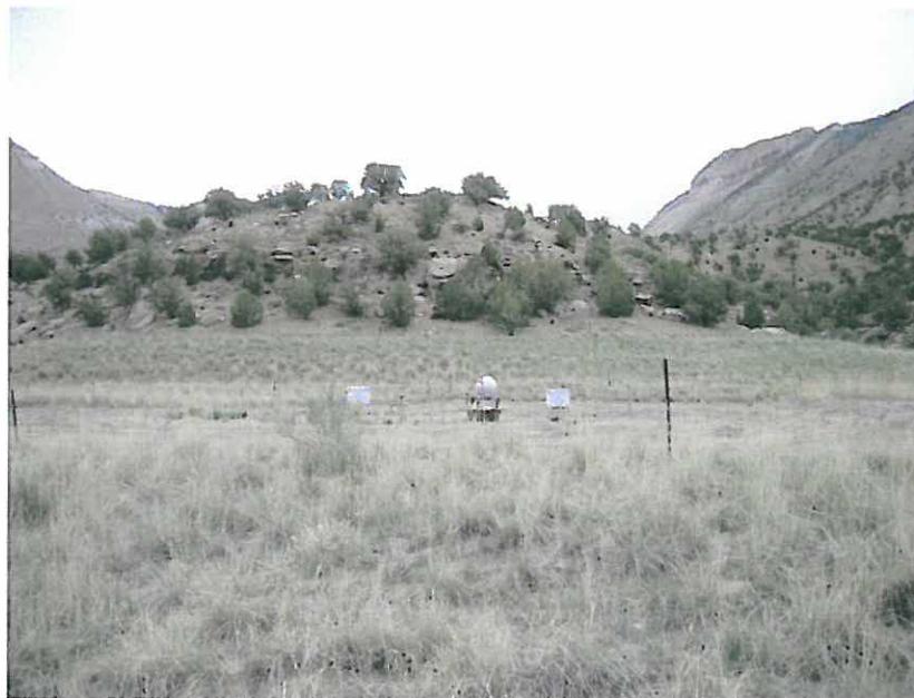
WELL PAD LOOKING NORTH