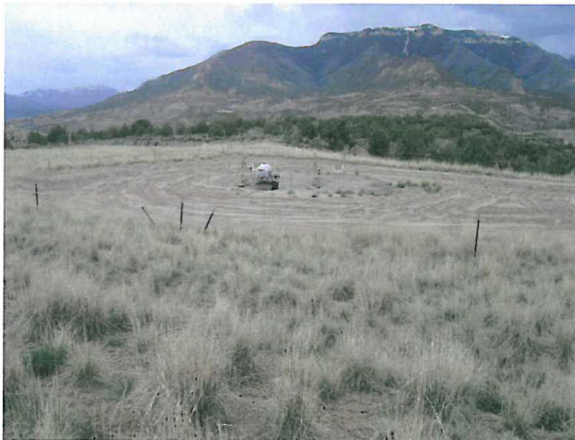
WELL PAD LOOKING SOUTH