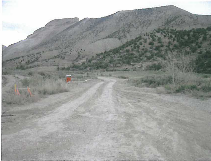
WELL PAD ACCESS ROAD

EXXON/MOBIL WELL PAD GM 331-34 EXISTING WELLS: GM 331-34, GM 431-34 PROPOSED WELLS: GM 531-34, GM 541-34, GM 441.-34, GM 341-34, GM 41-34 PHOTOS TAKEN 4/21/2010