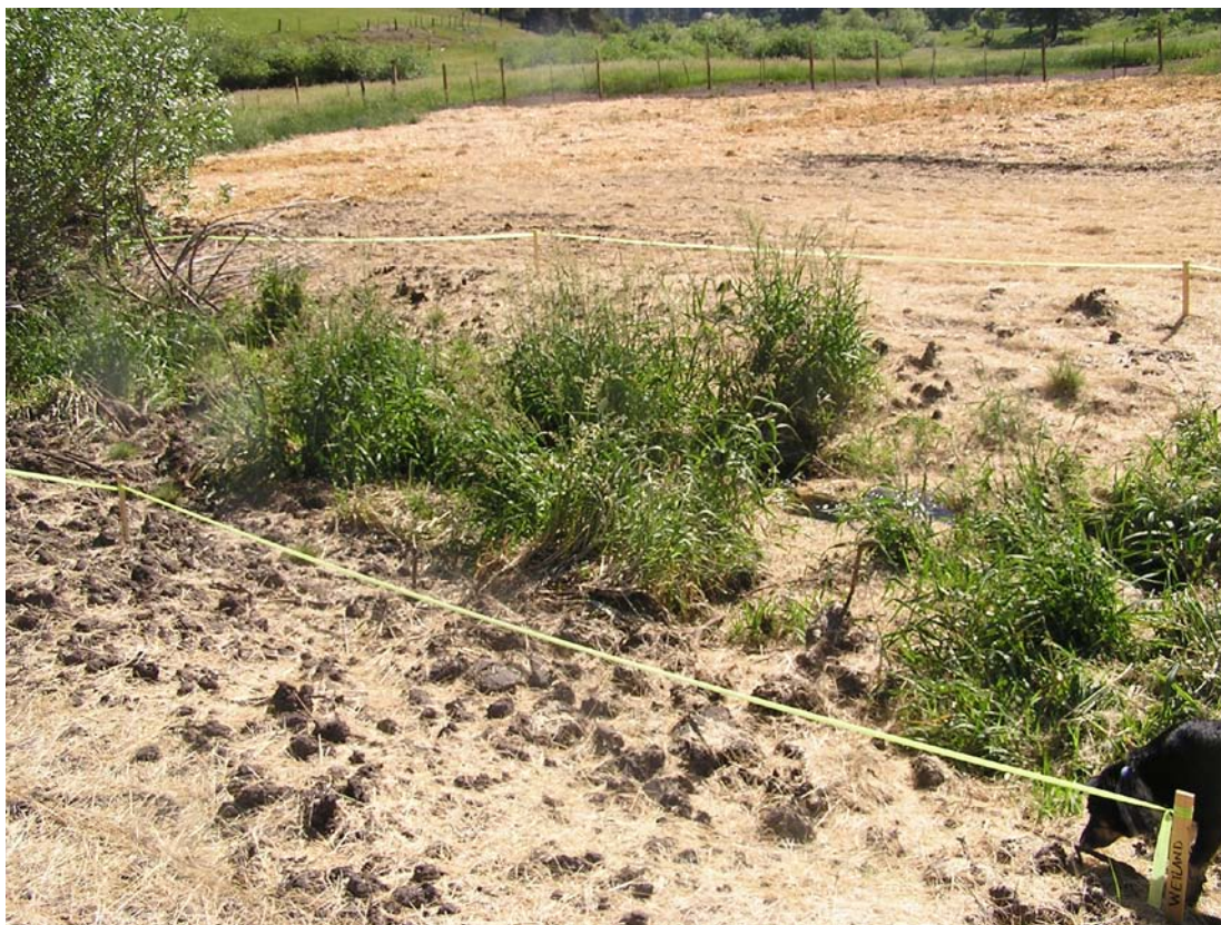
Figure 5 - South Fork Texas Creek Reclamation