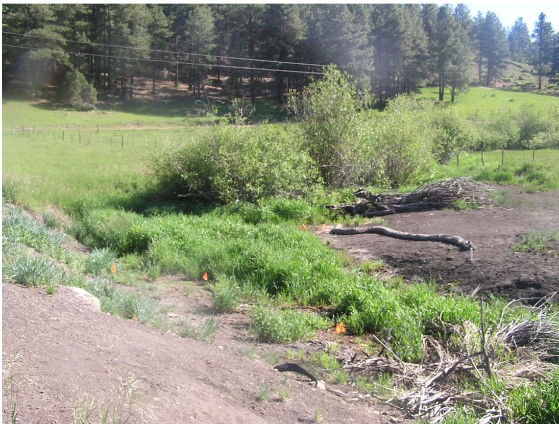
Figure 1 - South Fork Texas Creek Pre-Disturbance – looking south