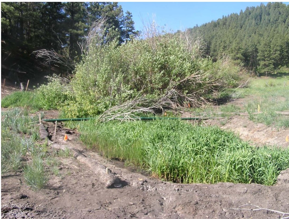
Figure 2 - South Fork Texas Creek Pre-Disturbance