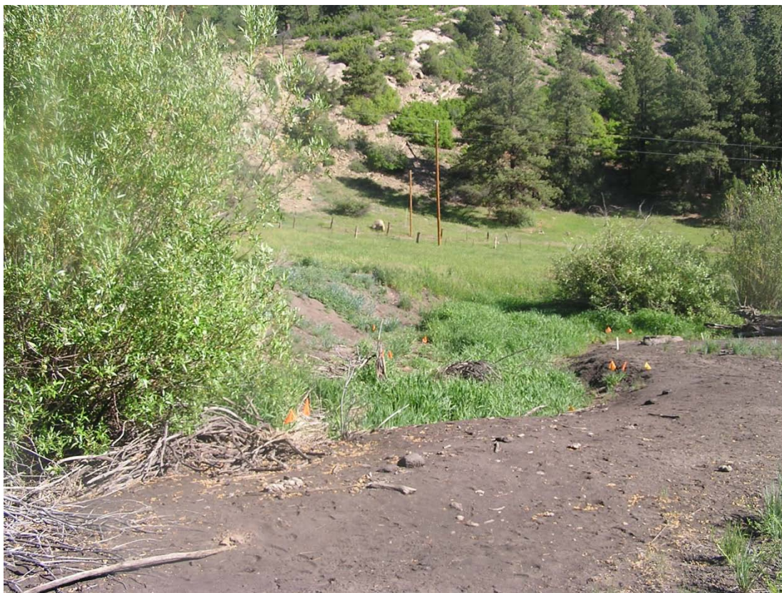
Figure 3 - South Fork Texas Creek Pre-Disturbance