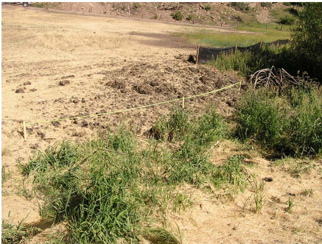
Figure 4 – South Fork Texas Creek Reclamation