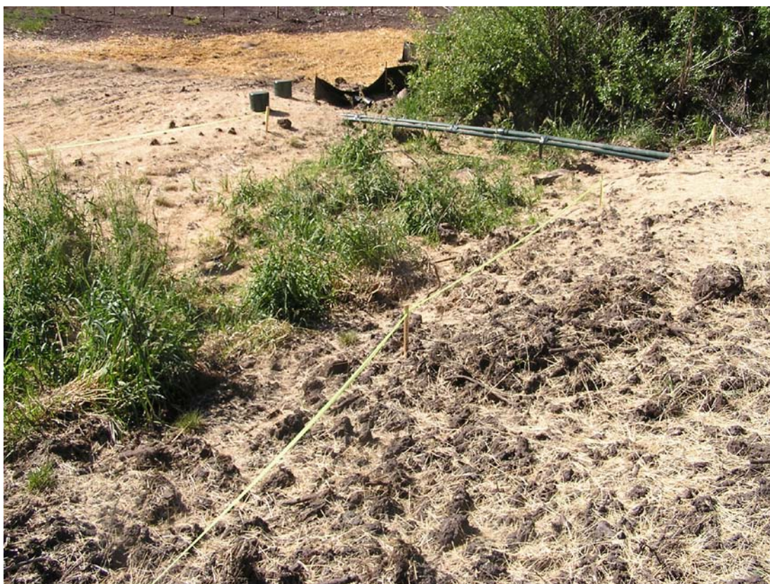
Figure 6 - South Fork Texas Creek Reclamation