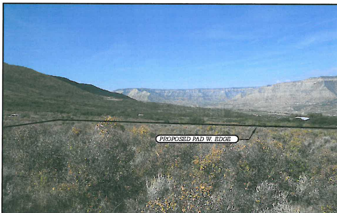
PHOTO: VIEW FROM PAD CENTER