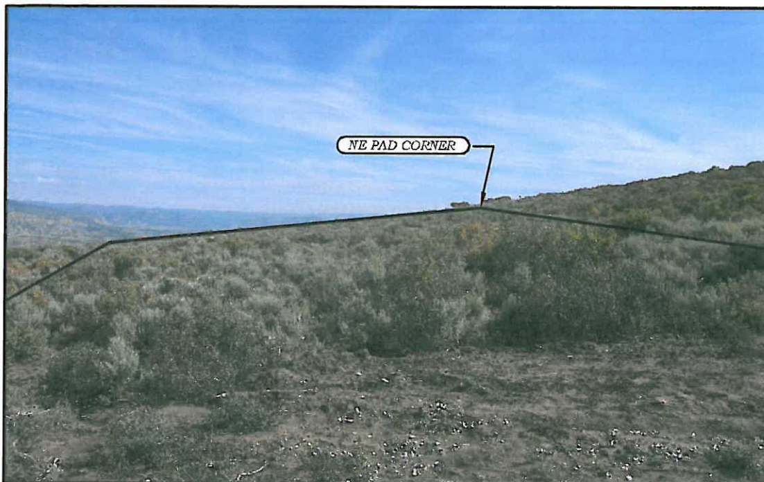
PHOTO: OVERALL VIEW FROM SW PAD CORNER